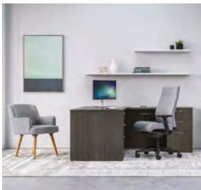
DESKS & SEATING