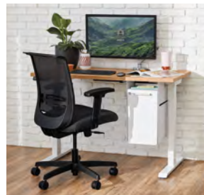
WORK FROM HOME