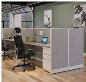
WORKSTATIONS & CUBICLES