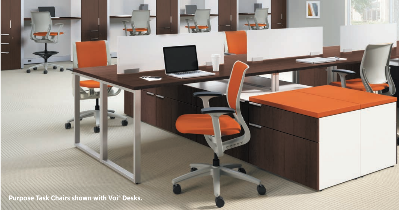
Purpose Task Chairs shown with Voi® Desks.