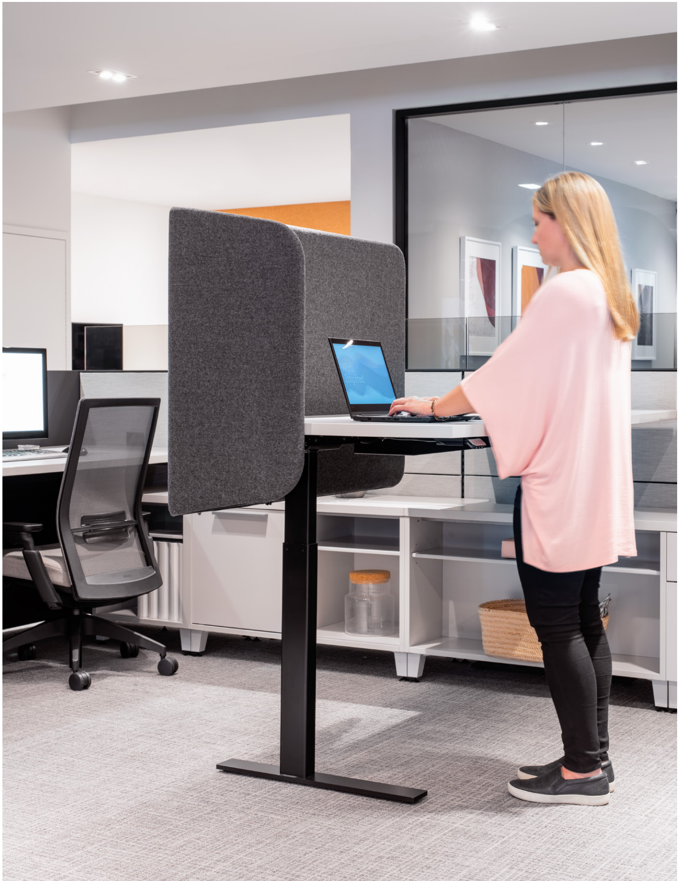
Cover Altitude A5 Table: Portico Teak Laminate Top, Nickel Base p. 2 Altitude A3 Tables: Portico Teak Laminate Top, Nickel Base Altitude Tables: Portico Teak Laminate Top, Silver Base p. 3 Altitude A5 Table: Brilliant White Laminate Top, Black Base Involve® Storage: Natural Maple Woodgrain Laminate, Topper Blazer Dartmouth Upholstery Stride® Panel: Appoint Frost Evo™ Task Chair: Dusk Mesh, Allsteel Leather Black Upholstery, Black Frame/Base