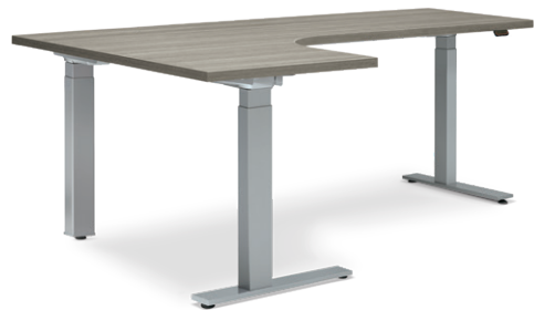
A5 Corner Cove