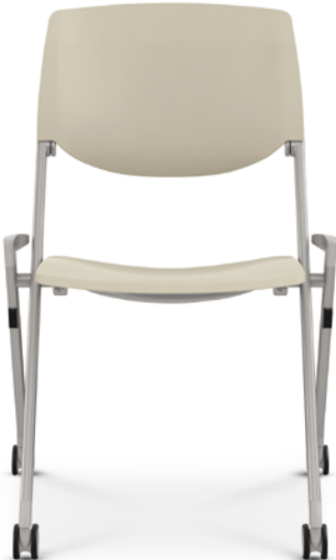
Polymer Back with Polymer Seat