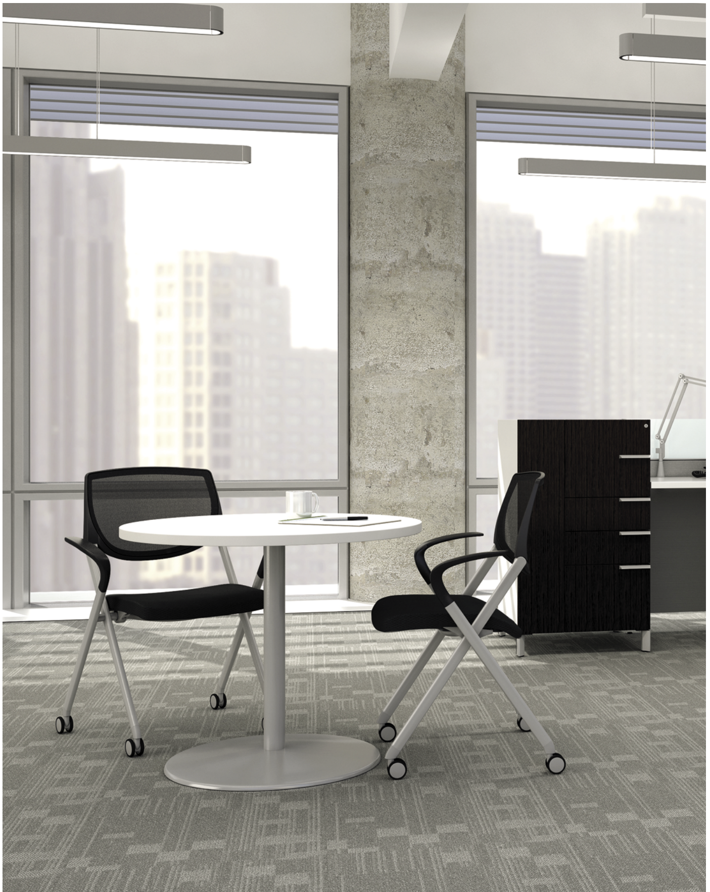
Cover Seek: Dusk Mesh, Hamilton Charcoal Upholstery, Black Frame p. 2 Seek with Arms: Dusk Mesh, Summit Mesh Carrier, Allsteel Leather Fog Upholstery, Silver Frame Seek Armless: Summit Polymer Shell, Silver Frame p. 3 Seek: Dusk Mesh, Black Mesh Carrier, Centurion Black Upholstery, Silver Frame Merge® Table: Frosty White Laminate Top, Textured Silver Base