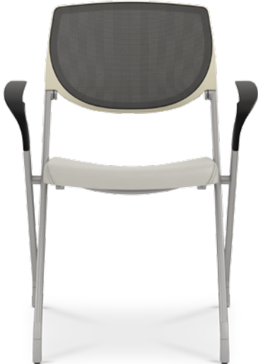
Mesh Back with Upholstered Seat

Seek is a lightweight and mobile seating solution with a variety of design options. This versatile chair can transform any area into a comfortable, adaptable, and collaborative space.