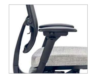
Fully adjustable arms, lumbar support, and seat depth provide a personalized sit

Innovative technologies and easy-to-use adjustments allow you to personalize your chair as quickly and as frequently as you change your task.