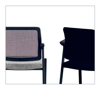
Available in upholstered, veneer, or mesh back options.