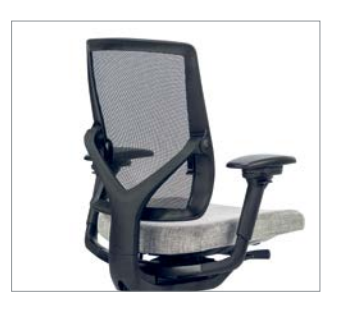
Chairs and stools have a pivoting back to maintain constant contact and comfort.