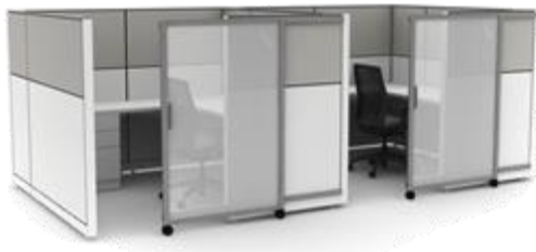
42.5"H panels w/ 22.5"H Stacking Frames Additional panels and panel system door **note that panel system door designed for 36" opening 50"H, 65"H, 80"H 42"W $4,226 - $6,046