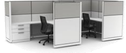
42.5"H panels w/ 22.5"H Stacking Frames Stacking frames available in 15"H, 22.5"H, 30"H 24"W – 60"W List Price: $425 - $580 (22.5"H Stacking Frame – Fabric) List Price: $807 - $1,109 (22.5"H Stacking Frame – Glass)