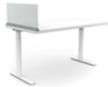
Stride Lateral Divider Screen (13\"/>