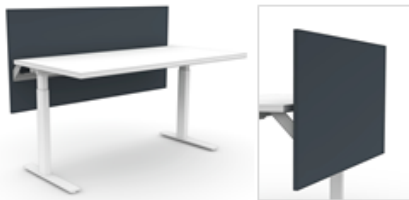
Stride Screen (28\"/>