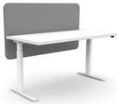
Altitude A8 Straight Screen (32\"/>