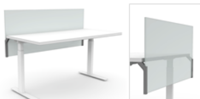
Involve End Privacy Panel (25\"/>