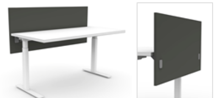
Involve End Privacy Panel (25\"/>