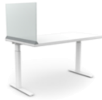
Stride Lateral Divider Screen (20\"/>