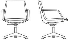
GGRA16-141 Guest, mid back, polished arms