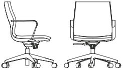
GSGNV17-051 Mid back, pillow single upholstery