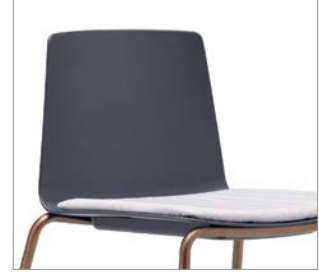
Optional seat pad on Vicinity chairs and stools offers more comfort.