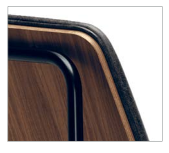
The Vicinity lounge and rocker chairs feature upholstery with a veneer shell or a fully upholstered back.