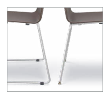
Available with a sled or four-leg base, the chairs are lightweight and easy to move.