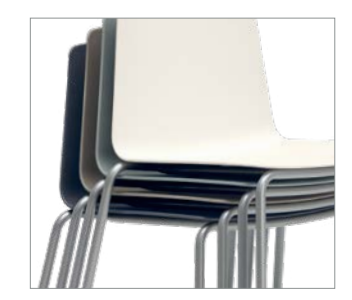
Vicinity chairs and stools stack up to 10 high, or 5 high with a seat pad.

The lightweight design of Vicinity seating allows for easy relocation wherever needed. Featuring a flexible polymer shell on chairs and stools, and an upholstered seat and back on the lounge chair, users can work and meet in comfort.