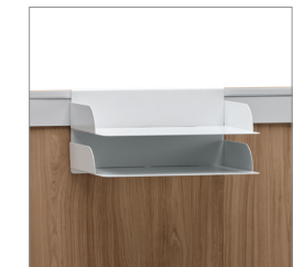
Dual paper tray