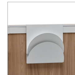
Dual paper file