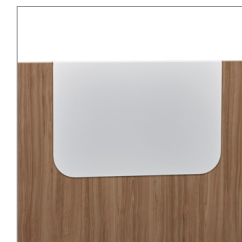
Hanging magnet/ markerboard