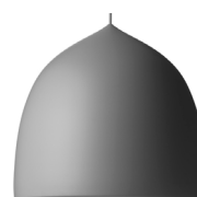
P2 LIGHT GREY