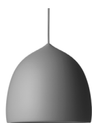
P1 LIGHT GREY

Suspence™ P1.5 is also offered in the standard colour Light grey.