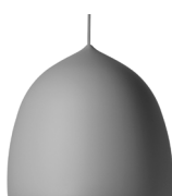
NEW SIZE P1.5 LIGHT GREY