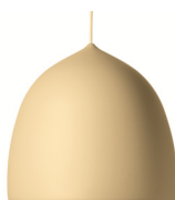
NEW SIZE P1.5 NEW COLOUR PALE PEARL