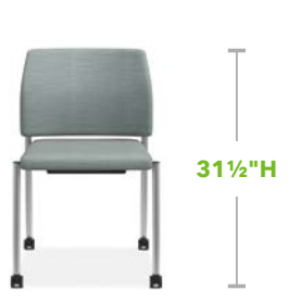
Seated Height Chair

The seated-height Accommodate chair is designed to work in waiting areas and cafes as well as meeting spaces and offices. 23½"W x 22½"D x 31¾"H