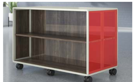
DOUBLE THE STORAGE Store away from the wall with cubbies and bookcases that have nooks on both sides

Gone are the days of one-size-fits-all cubbies. Today's education environments have discovered a more holistic approach to organization and kinesthetic learning, and that means more choices and smarter logistics. With its dynamic, multifunctional design and straightforward mobility, Class-ifi encourages healthy movement throughout the day and defines a variety of organizational and learning hubs in any space-large or small.