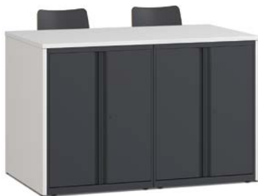
Compatible with Flagship® Storage