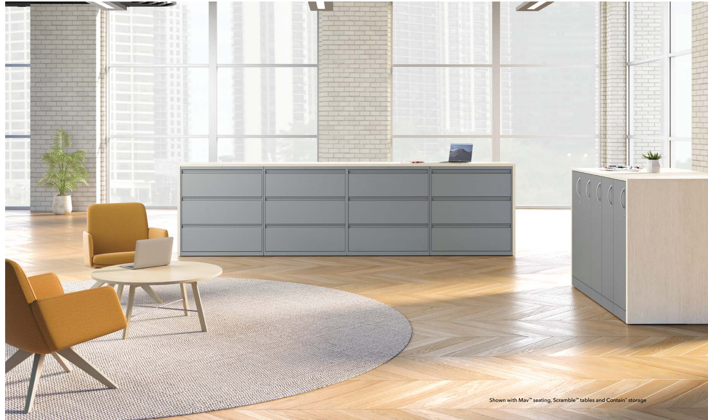
Shown with Mav™ seating, Scramble™ tables and Contain™ storage

Standard storage has its merits—general filing, simple organization, and maybe a place to stash an extra pair of sneakers. But why stay in the stone age if you’ve got the choice to evolve your current office organization into a dynamic, multifunctional hub? Designed to fit over existing storage to create dual purpose spaces, these practical and customizable laminate shells not only consolidate your work environment, they open the floor for meaningful collaboration, effortless connection, and seamless productivity. So, take a vacation away from office chaos—Storage Islands makes it simple to enhance your organization, workflow, and aesthetic.