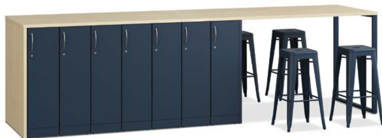
Compatible with Contain® Storage