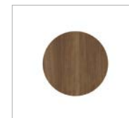
ROUND TOP Available in 24", 30", 36" and 42"

Arrange is available in four different worksurface shapes and sizes, as shown below.