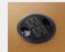
Standard 3" Round power grommet

Route technology through the base directly to the tabletop with optional power grommets.