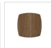
SOFT SQUARE TOP Available in 24", 30", 36" and 42"