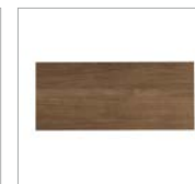
RECTANGLE TOP Available in 24" and 30" widths and 48", 60" and 72" lengths