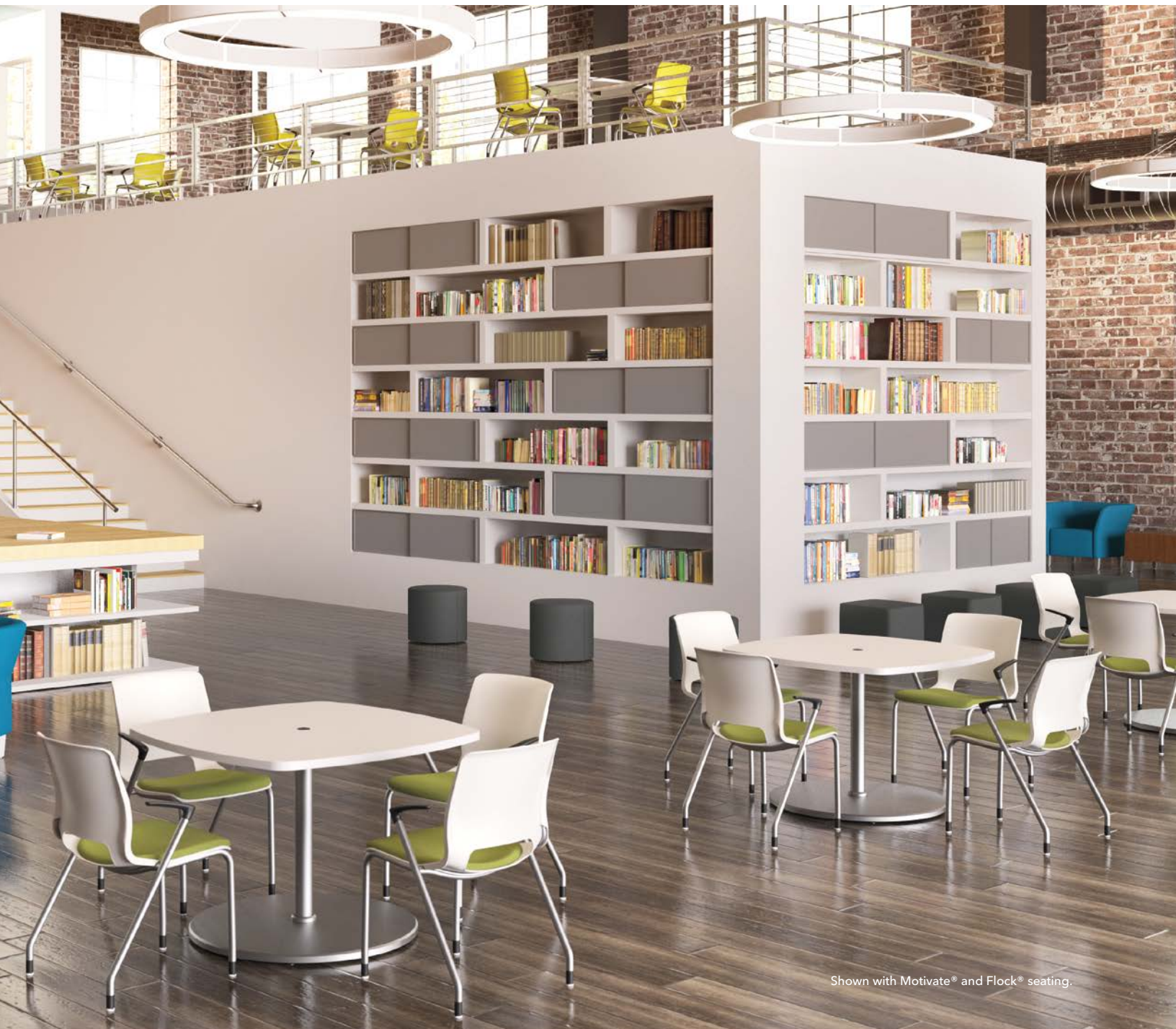
Shown with Motivate® and Flock® seating.