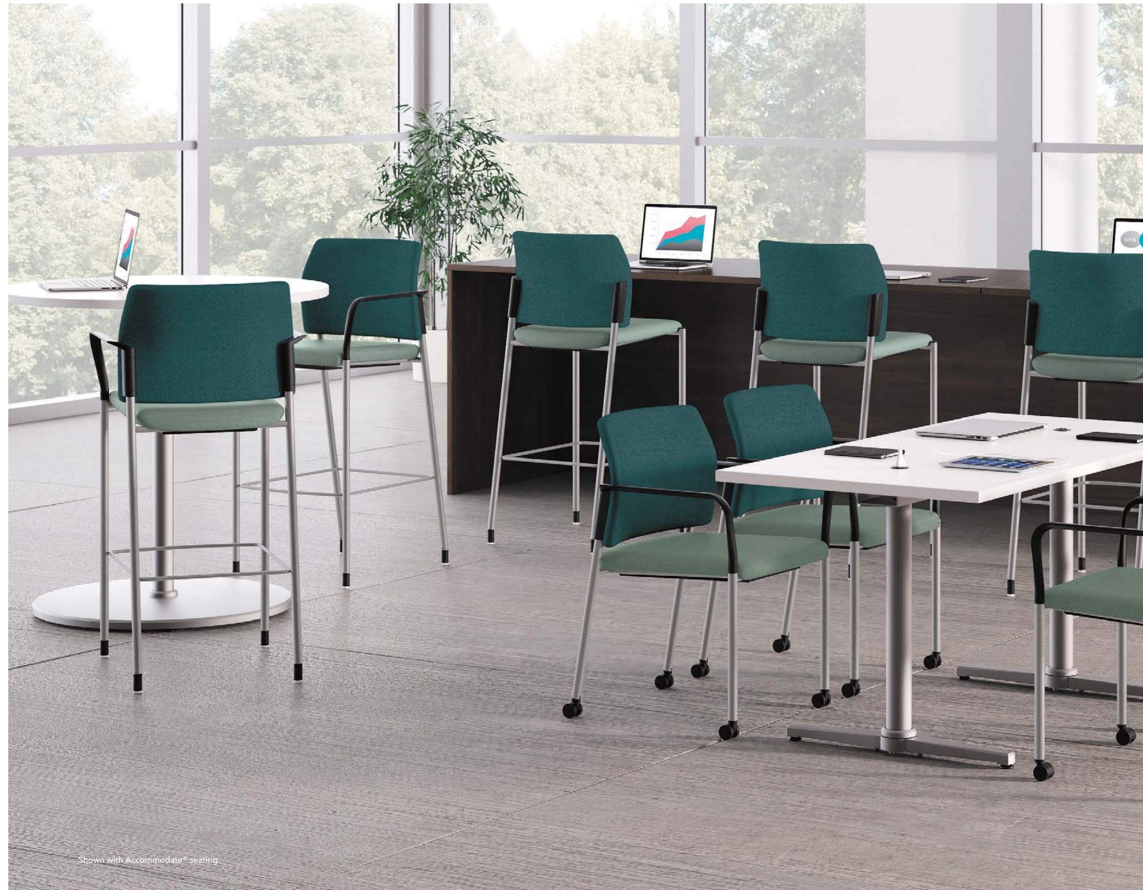
Shown with Accommodate® seating.