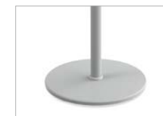
DISC SHROUD BASE