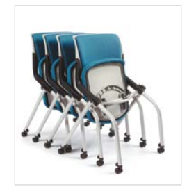
Nesting/Stacking Chairs Ready at a moment's notice, they are comfortable enough to sit through a full day of training, yet easily and effortlessly pushed out of the way when not in use.