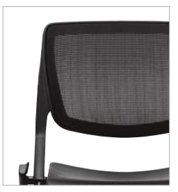
4-Way Stretch Mesh support, comfort, breathability and air flow.