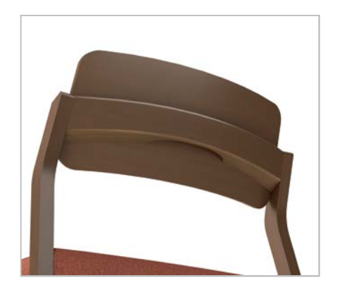
INTEGRATED BACK HANDLE Designed to support user functionality, Confer's integrated back handle makes reconfiguration simple and straightforward.