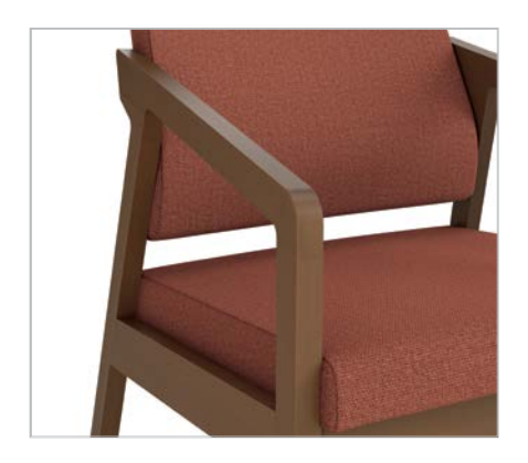
RELAXED ARMS Confer's sloped arm design offers a comfortable, supportive sit.