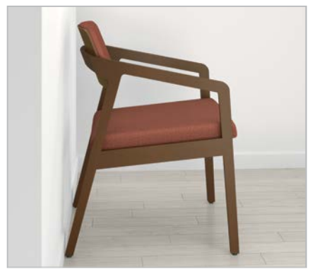
WALL-SAVER LEGS Confer's angled back legs are thoughtfully crafted to protect your walls from damage.