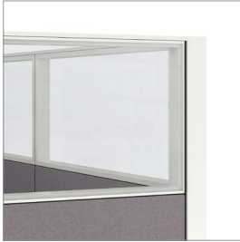
Framed Glass Stacker