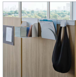
Gallery Panel Accessories