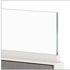
Frameless Glass Stacker

These are just a sampling of the options for Optimize.