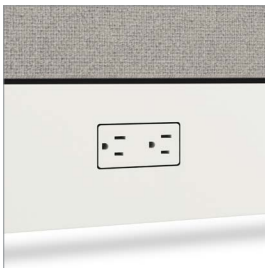
Base Raceway Power