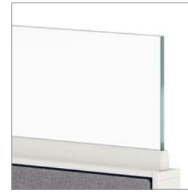
Frameless Glass Stacker

These are just a sampling of the options for Optimize.