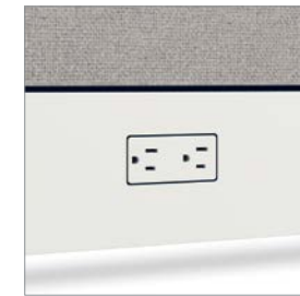
Base Raceway Power