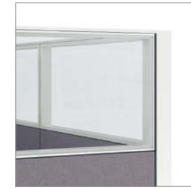
Framed Glass Stacker