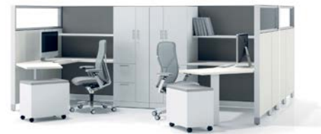
Full-height footed panels topped with low-profile glass provide maximum user privacy and separation. Shown with Stride storage.