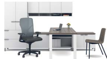
A workwall of storage in the private office offers safekeeping for project work, archival materials, and personal belongings. Shown with Stride storage.