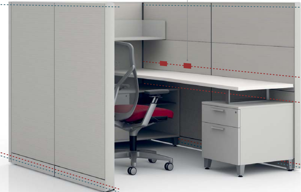
Above Desktop For powering everyday personal items, such as a phone, tablet, or laptop.