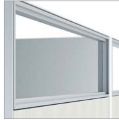
Low-profile panel glass