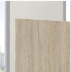
Square corner Gallery Panel