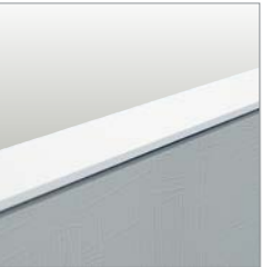
3" thick panel