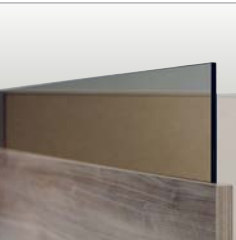
Gallery Panels with frameless glass