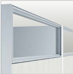
Low-profile panel glass