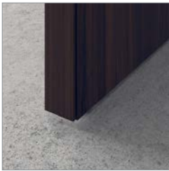
To-the-floor veneer panel tiles