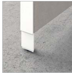
Footed panel with fabric tiles