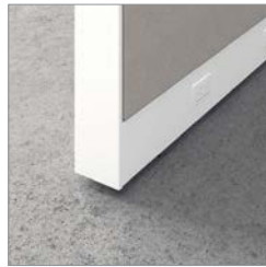
Base raceway panel with fabric tiles