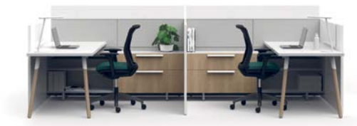
Stride panels with frameless glass and light-scale gallery panels and worksurface legs keep the look clean, lean, and bright. Shown with Approach™ storage.

Because each Stride component was designed with every other component in mind, the entire collection works together seamlessly. Stride also works well with other products. When you pair complementary gallery panels, storage, and height-adjustable worksurfaces with Stride panels, workers have the freedom to work how they want throughout the day to maintain comfort and productivity. Create one-of-a-kind workspaces that suit the people who use them.