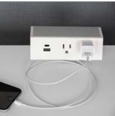
Power access & wire management