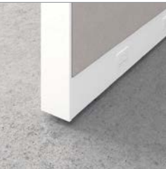
Base raceway panel