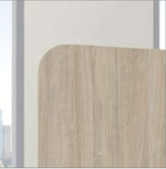
Radius corner Gallery Panel