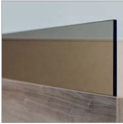
Gallery panels with frameless glass