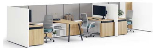
Higher panels surrounding integrated height-adjustable worksurfaces give users privacy when standing. Shown with Approach storage.