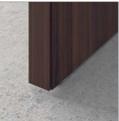
To-the-floor veneer panel tiles