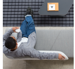
Relaxed casual postures or active working postures, Peak accommodates whatever the need throughout the day.