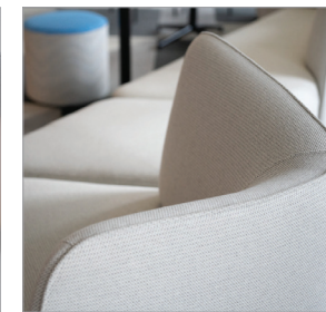
The interesting asymmetrical shapes create numerous unique and functional configurations.