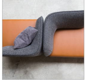
A gently sloped back provides lumbar and back support while offering privacy for those seeking concentration.