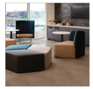
Built-in slide glides enable users to easily reconfigure Peak for team collaboration or focused work.

User-movable Peak micro-environments throughout the office landscape address a broad range of seating postures for how people like to work and relax. The sculptural, modular design allows units to connect in multiple ways.