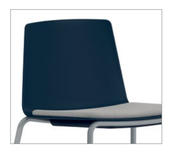
Optional seat pad on Vicinity chairs and stools offers more comfort.