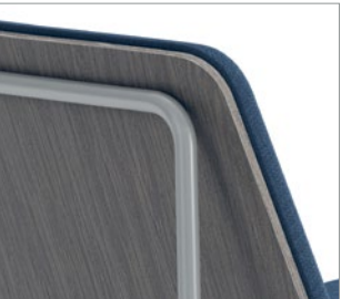
The Vicinity lounge and rocker chairs feature upholstery with a veneer shell or a fully upholstered back.