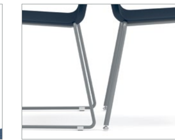
Available with a sled or four-leg base, the chairs are lightweight and easy to move.