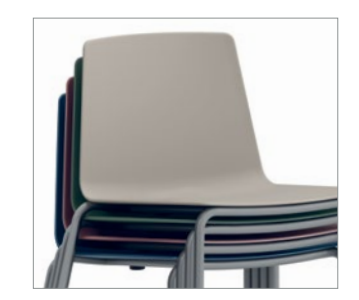
Vicinity chairs and stools stack up to 10 high or 5 high with a seat pad.

The lightweight design of Vicinity seating allows for easy relocation wherever needed. Featuring a flexible polymer shell on chairs and stools, and an upholstered lounge chair and rocker, users can work and meet in comfort.