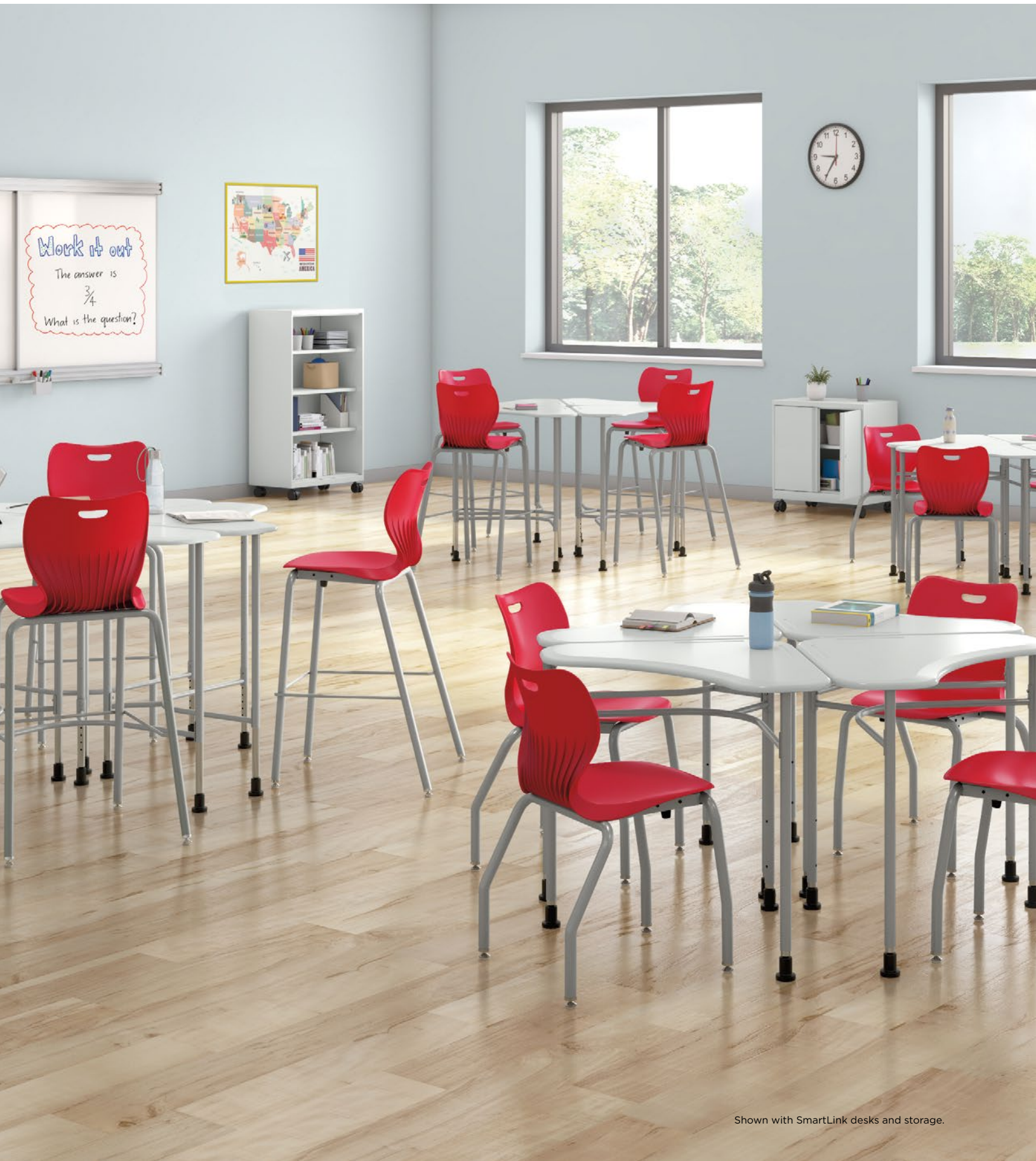
Shown with SmartLink desks and storage.