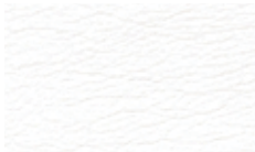
SUF554008 White Wash