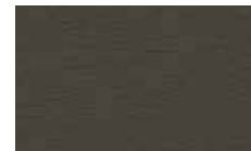
SUF554376 Dark Chocolate