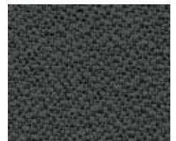
CU19 Iron Ore