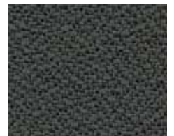
CU19 Iron Ore