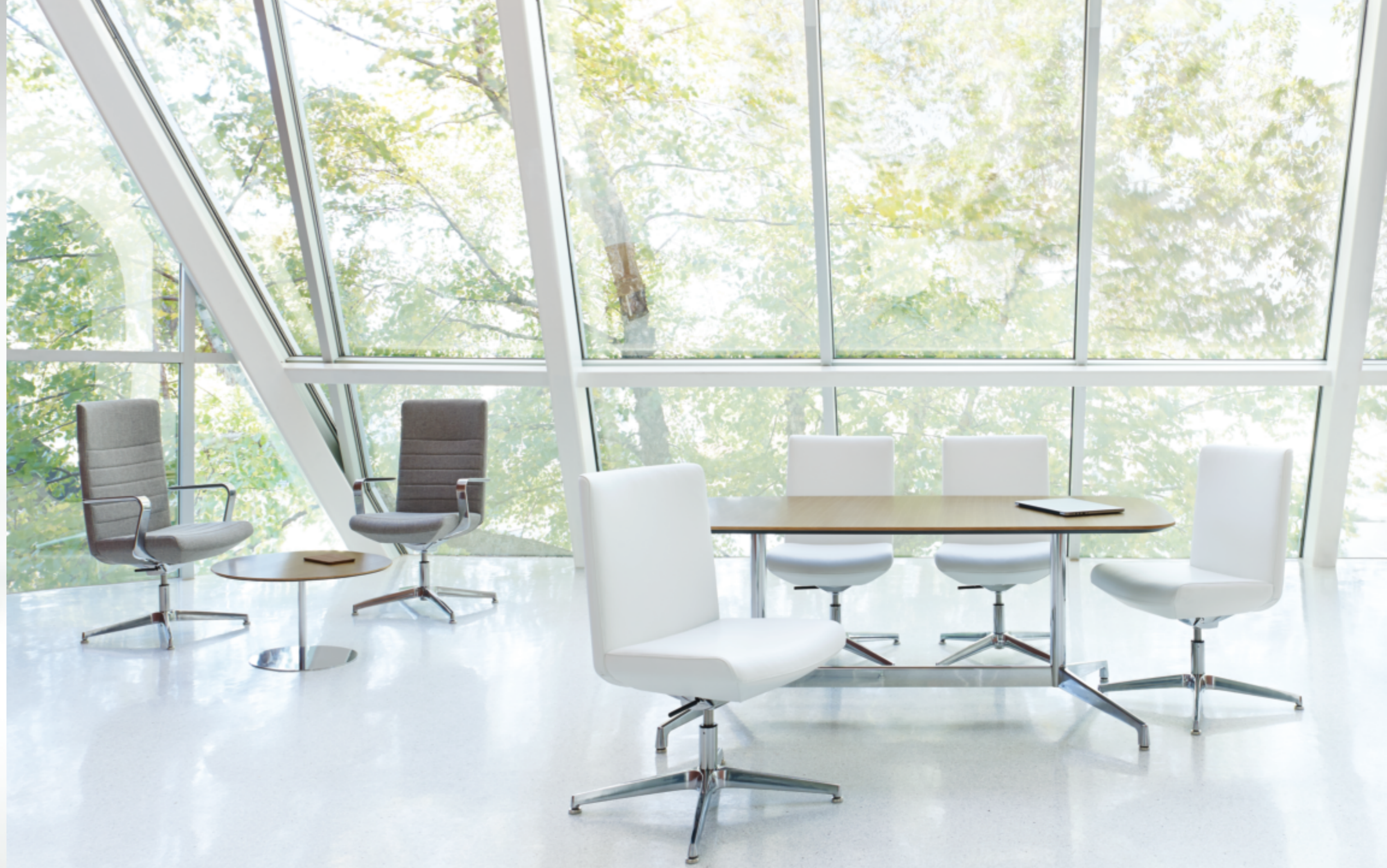
AVOCA GUEST MODEL GGHA15-071 · HIGH BACK WITH ARMS · APA POLISHED ARMS · SD STITCH DETAIL · MOMENTUM COVER CLOTH OAT AVOCA GUEST MODEL GGHA15-061 · MID BACK ARMLESS · MOMENTUM COVER CLOTH OAT