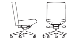
GSHA15-021 Mid back, armless