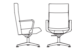
GGHA15-071 High back with arms