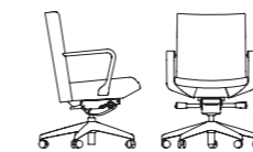
GSHA15-041 Mid back with arms