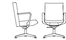
GGHA15-081 Mid back with arms