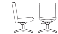
GGHA15-061 Mid back, armless