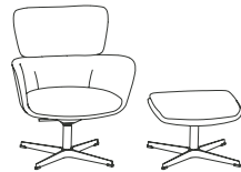
GLIRS17-011 Single upholstery lounge, metal base