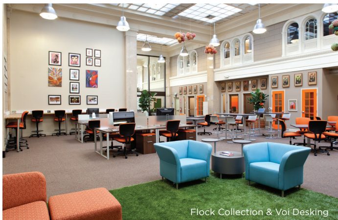
Flock Collection & Voi Desking