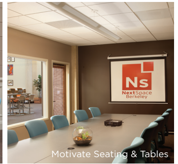
Motivate Seating & Tables