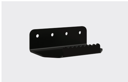
FOOT DOOR PULL