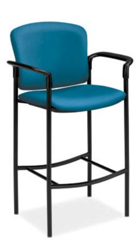
STOOLS THAT FIT RIGHT IN Stools are a key component of Pagoda's versatility. Line them up at counters or pair them with high tables in cafés or collaborative work areas for a handsome, sturdy, and practical seating solution that enhances both the look and functionality of practically any space.