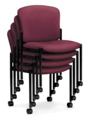
THE OPTIONS STACK UP Stacking chairs come outfitted with a choice of casters or glides, and stack up to five-high with or without arms.