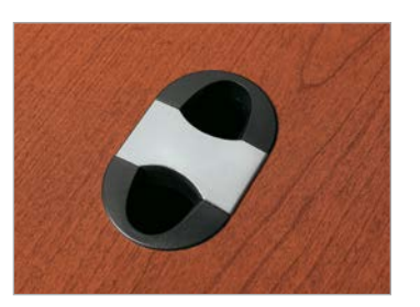
CORD MANAGEMENT Organize cables to reduce desktop clutter.