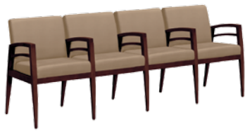
FOUR-SEAT GANGED UNIT 87½"W x 24¼"D x 33¾"H