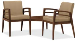
TWO-SEAT GANGED UNIT WITH CORNER TABLE 51"W x 51"D x 33¾"H