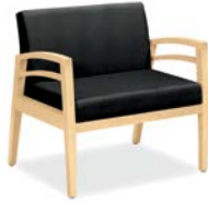
STAND ALONE BARIATRIC CHAIR 34"W x 26½"D x 33½"H