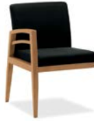
SINGLE ENDLINE GANGING CHAIR 21½"W x 24¼"D x 33¾"H