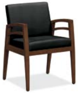
STAND ALONE GUEST CHAIR 23"W x 24½"D x 33¾"H

Plan your seating arrangement around your needs and existing architecture with a combination of straight rows of seating, stand-alone chairs, and corner and center tables.