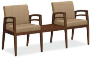
TWO-SEAT GANGED UNIT WITH CENTER TABLE 68¾"W x 24¼"D x 33¾"H