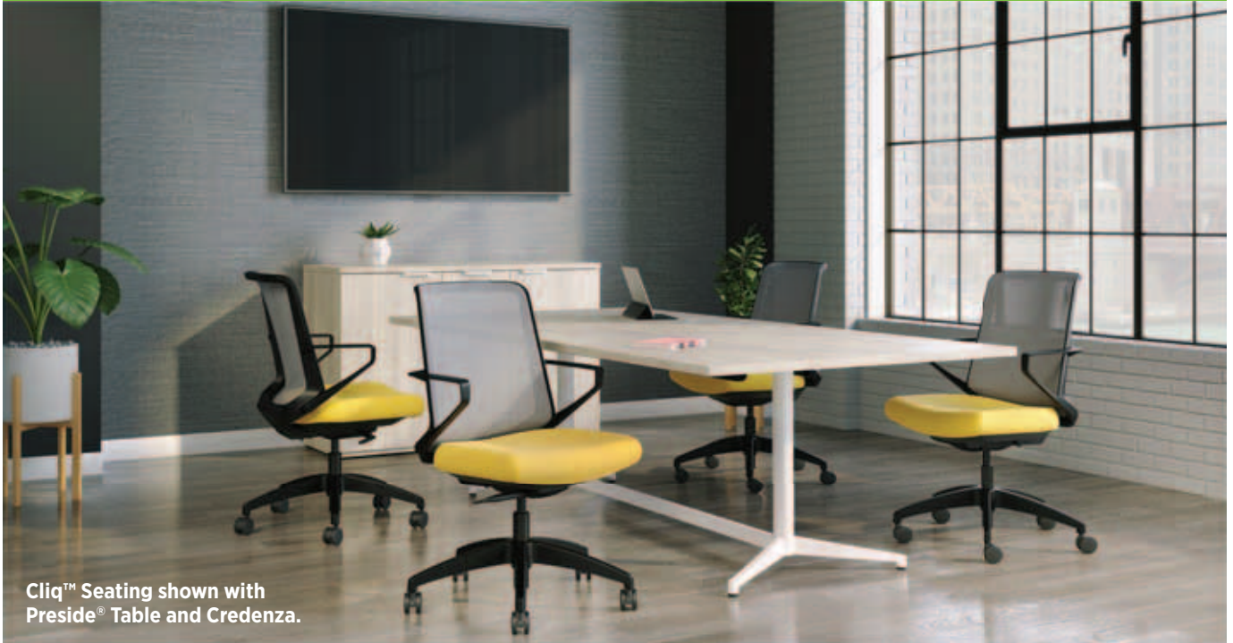
Cliq™ Seating shown with Preside® Table and Credenza.