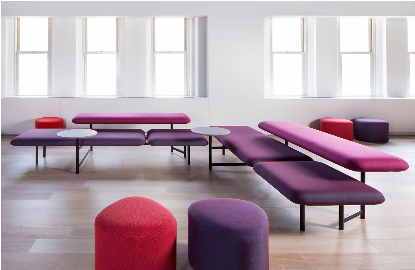
Table Finish Options