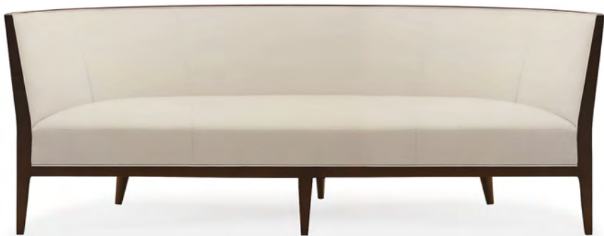
Lounge with exposed wood frame