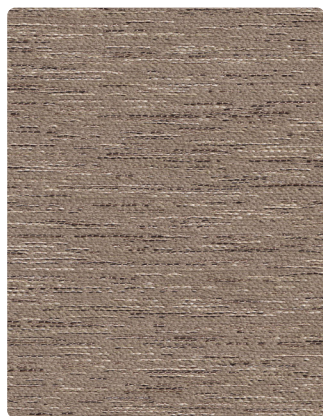
1049-37 Shifting Sands