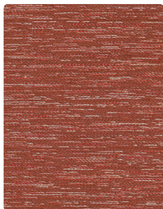
1049-46 Spicy Red