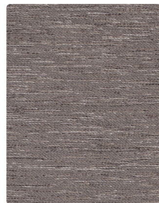
1049-84 Gopher Gray