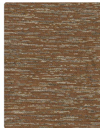
1049-30 Golden Brown