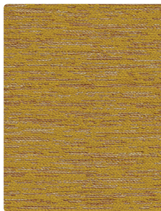
1049-63 Turmeric Yellow