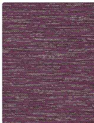
1049-77 Violet Shades