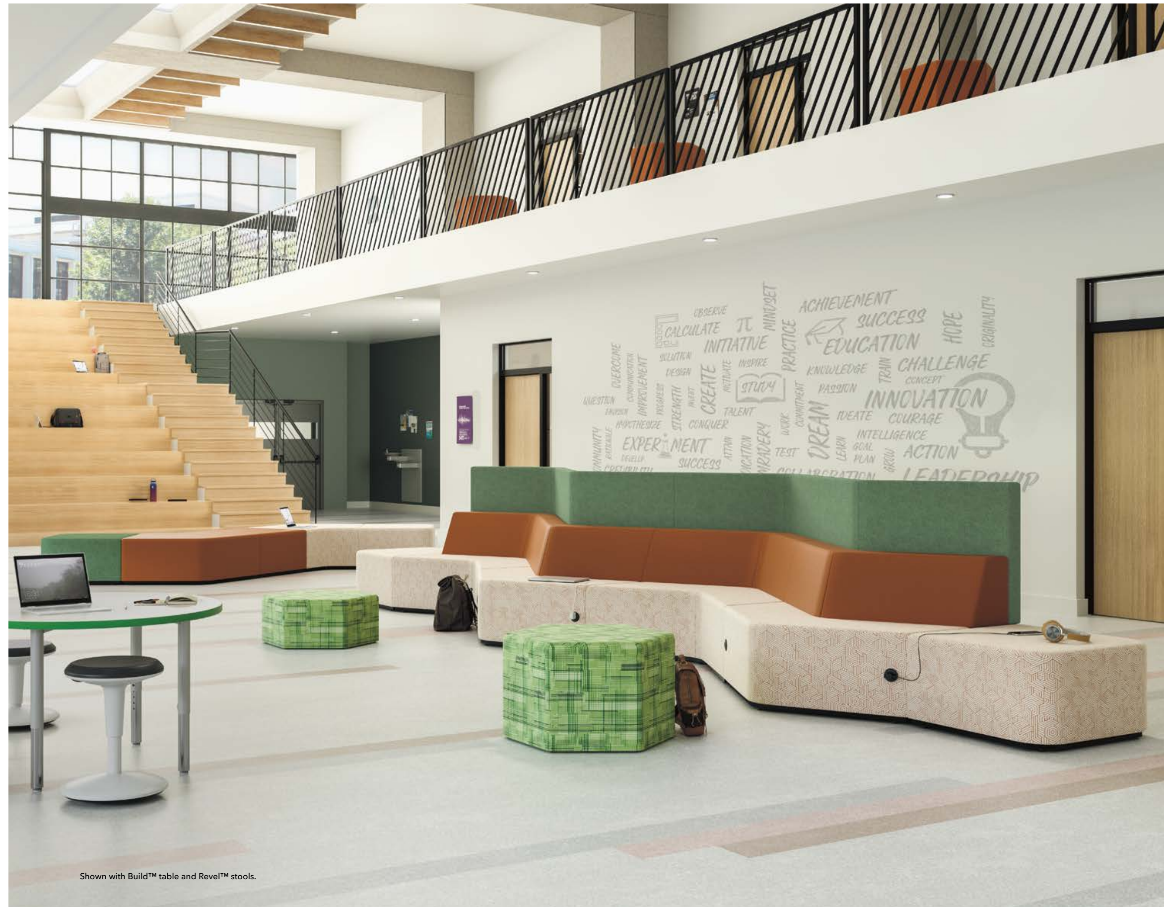
Shown with Build™ table and Revel™ stools.