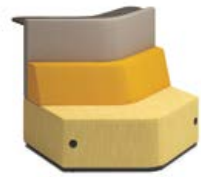
Bistro High-Back Arrow-Out Seat