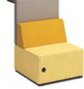
Bistro High-Back Square Seat