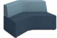
Low-Back Arrow-In Seat