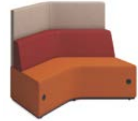
High-Back Arrow-In Seat