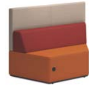
High-Back Trapezoid Seat