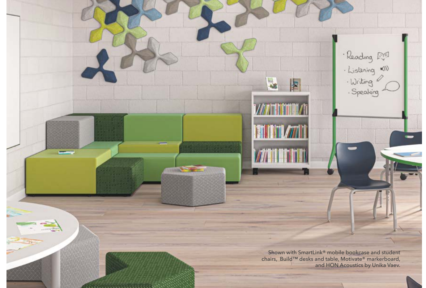
Shown with SmartLink® mobile bookcase and student chairs, Build™ desks and table, Motivate® markerboard, and HON Acoustics by Unika Vaev.