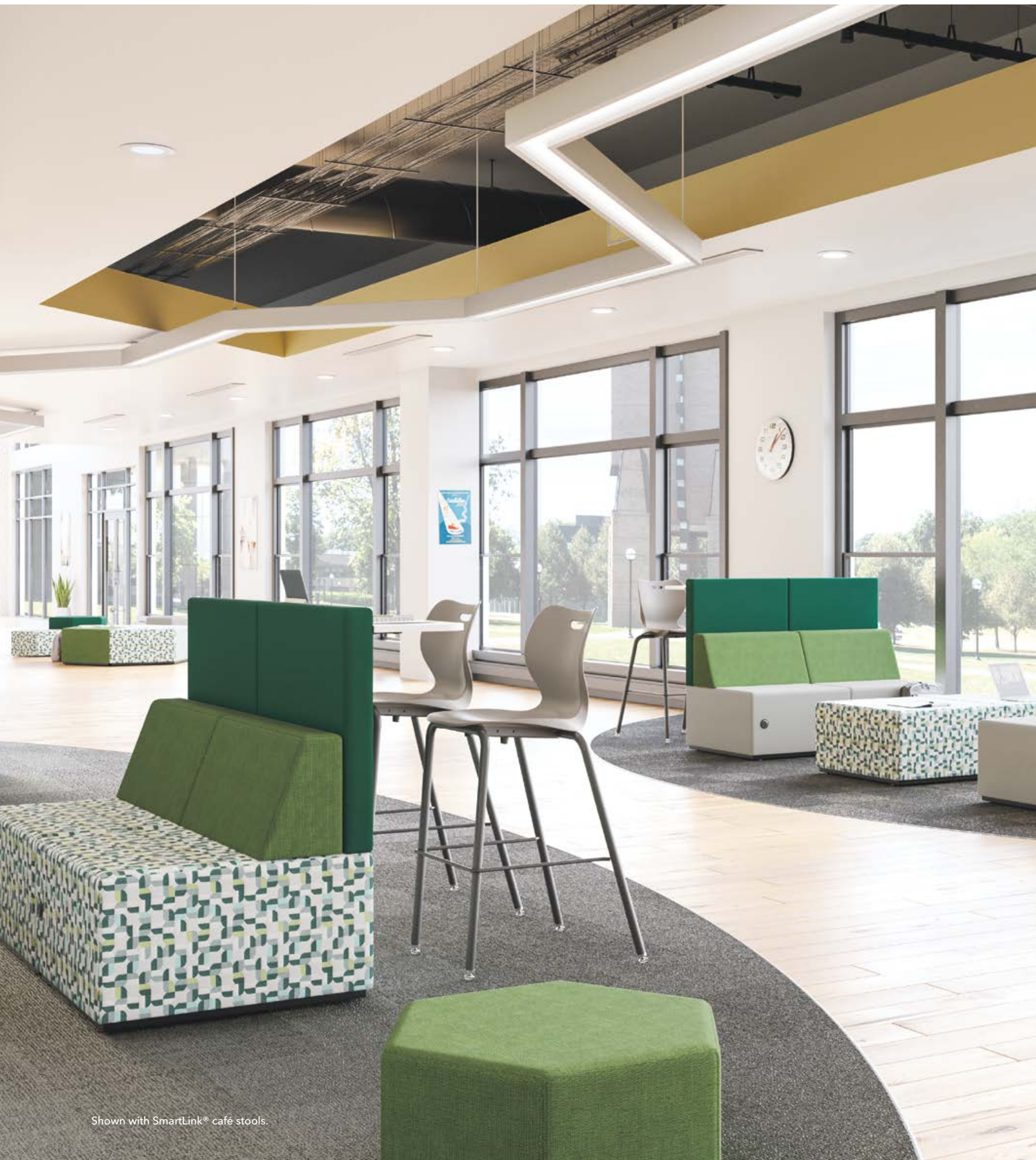
Shown with SmartLink® café stools.