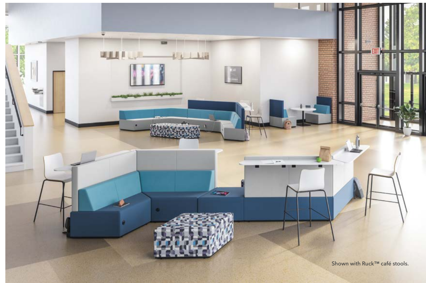
Shown with Ruck™ café stools.

School isn't just about studying—it's an important part of socialization, too. Tangram's Bistro-Back table enhancement offers multitasking students another choice on how to use this dynamic seating solution—they can sit in back OR in front, depending on their needs. Plus, with this adaptable table's rounded corners and easily cleanable laminate surface, young learners can stay safe and healthy no matter what the day holds. From sharing a snack with friends to brainstorming on a shared project, we've elevated Tangram to new heights to encourage greater focus, easy relaxation, and deeper connections.