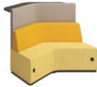
Bistro High-Back Arrow-In Seat