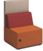
High-Back Square Seat