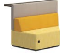
Bistro High-Back Trapezoid Seat