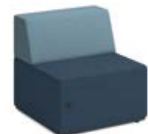
Low-Back Square Seat