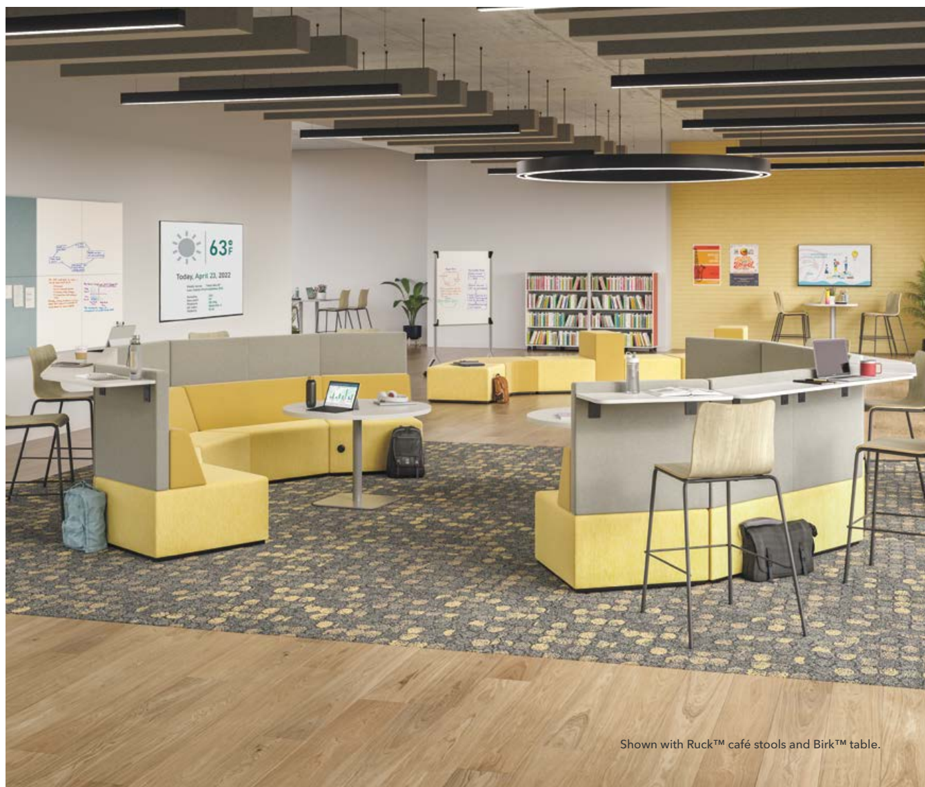
Shown with Ruck™ café stools and Birk™ table.

See HON Pricer for complete product information.