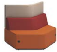
High-Back Arrow-Out Seat