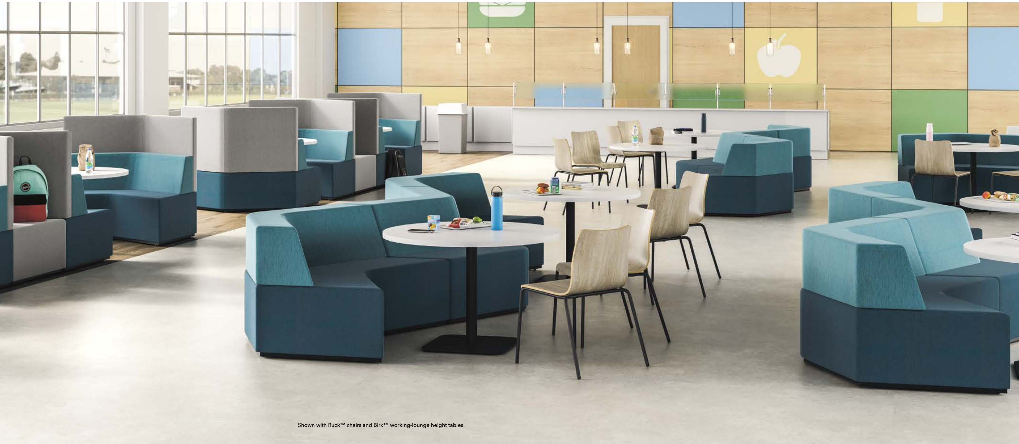
Shown with Ruck™ chairs and Birk™ working-lounge height tables.