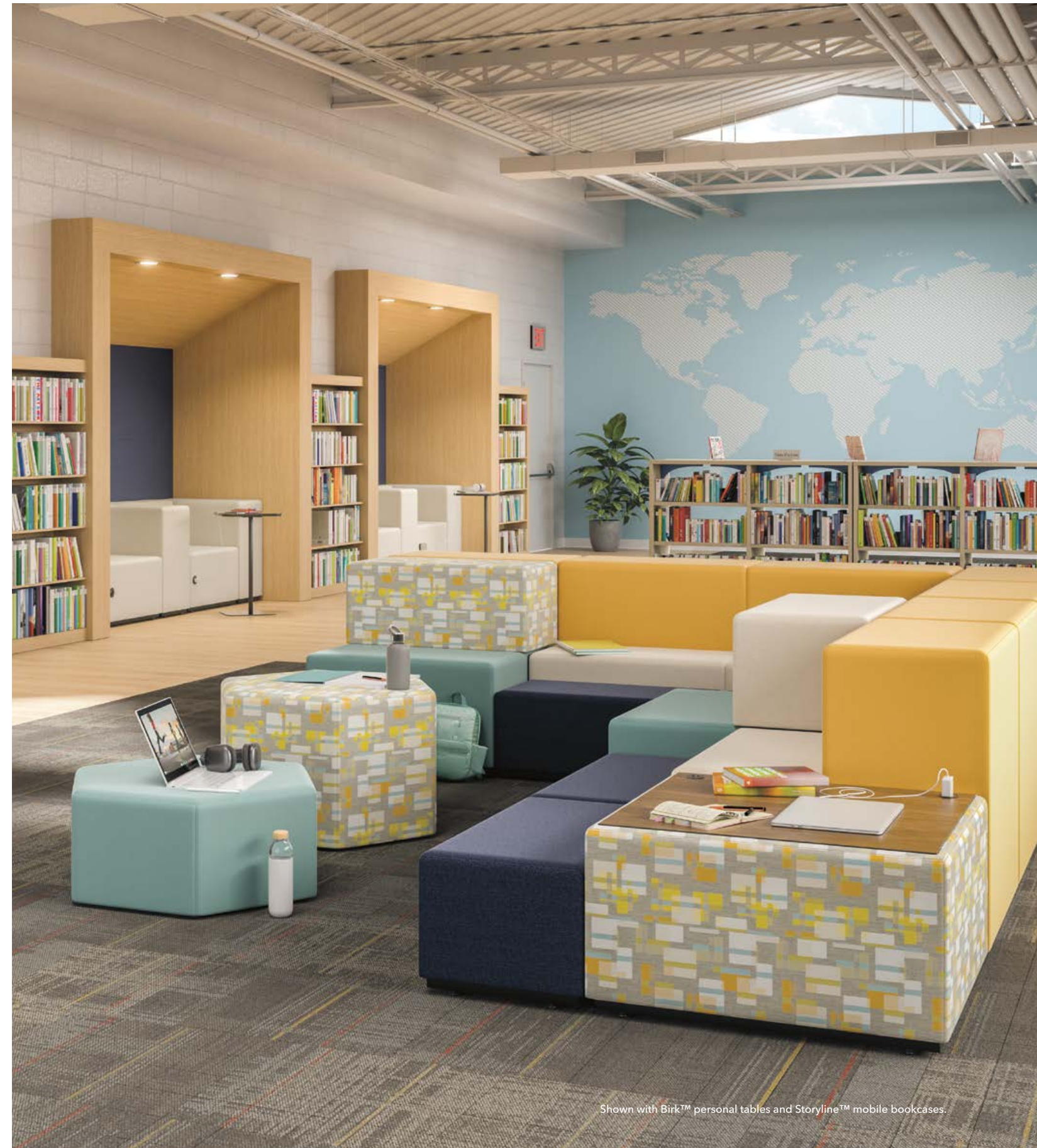
Shown with Birk™ personal tables and Storyline™ mobile bookcases.