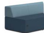
Low-Back Trapezoid Seat