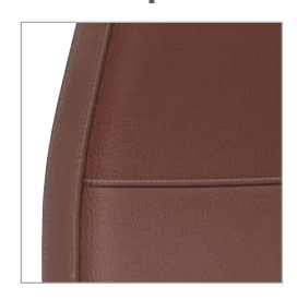
CONTRAST STITCH Includes additional top stitches which are available in a variety of color options for an elevated look.