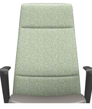
SOLID STITCH BACK