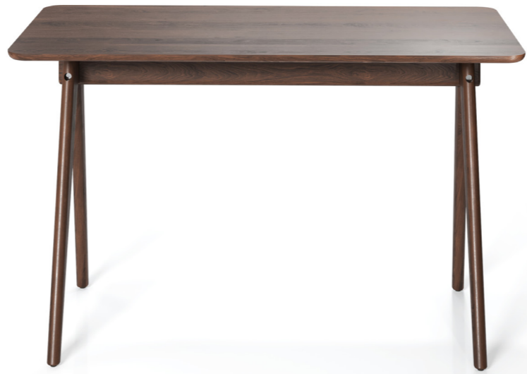
RK937 – Bark