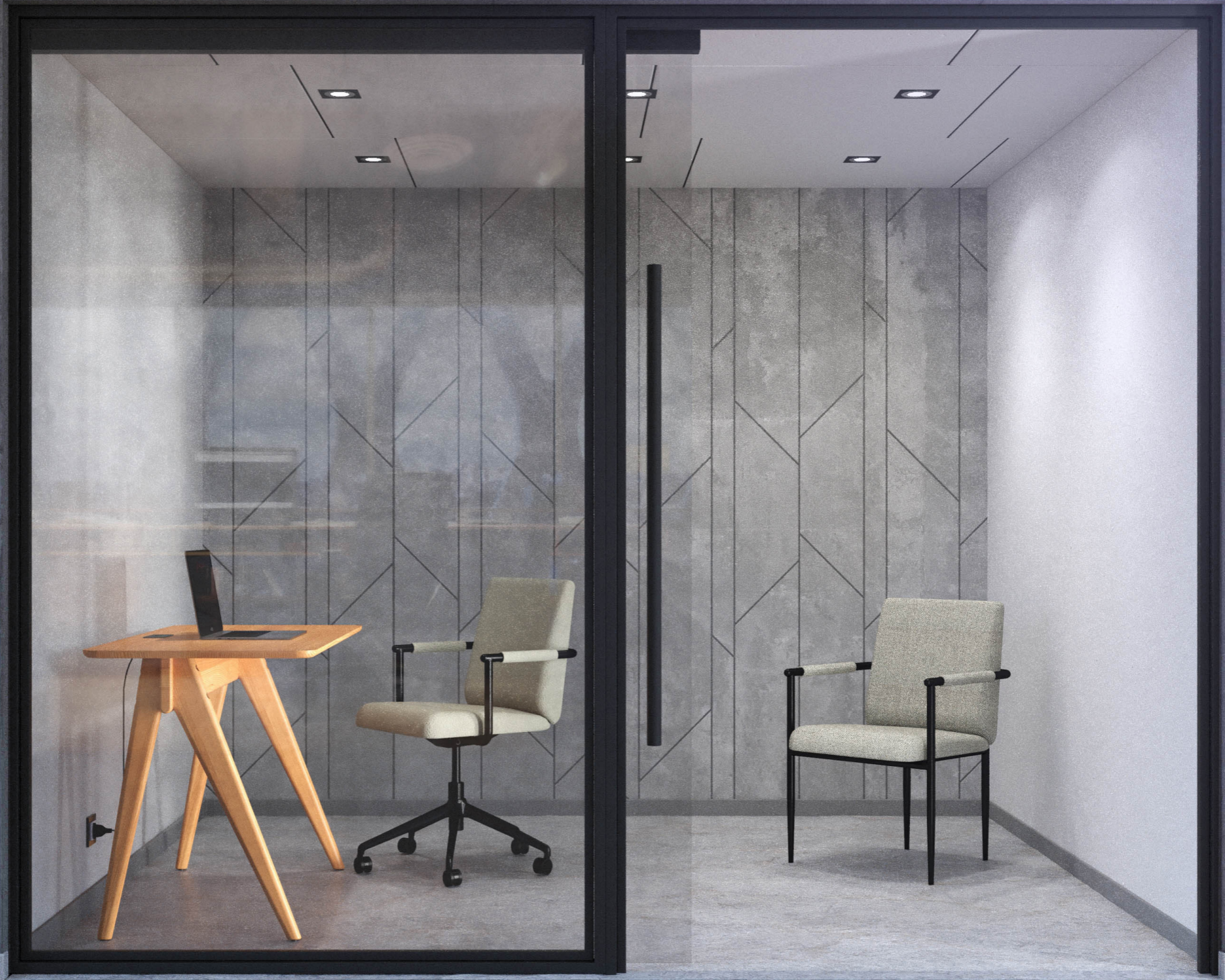
Note Desk + Social Seating