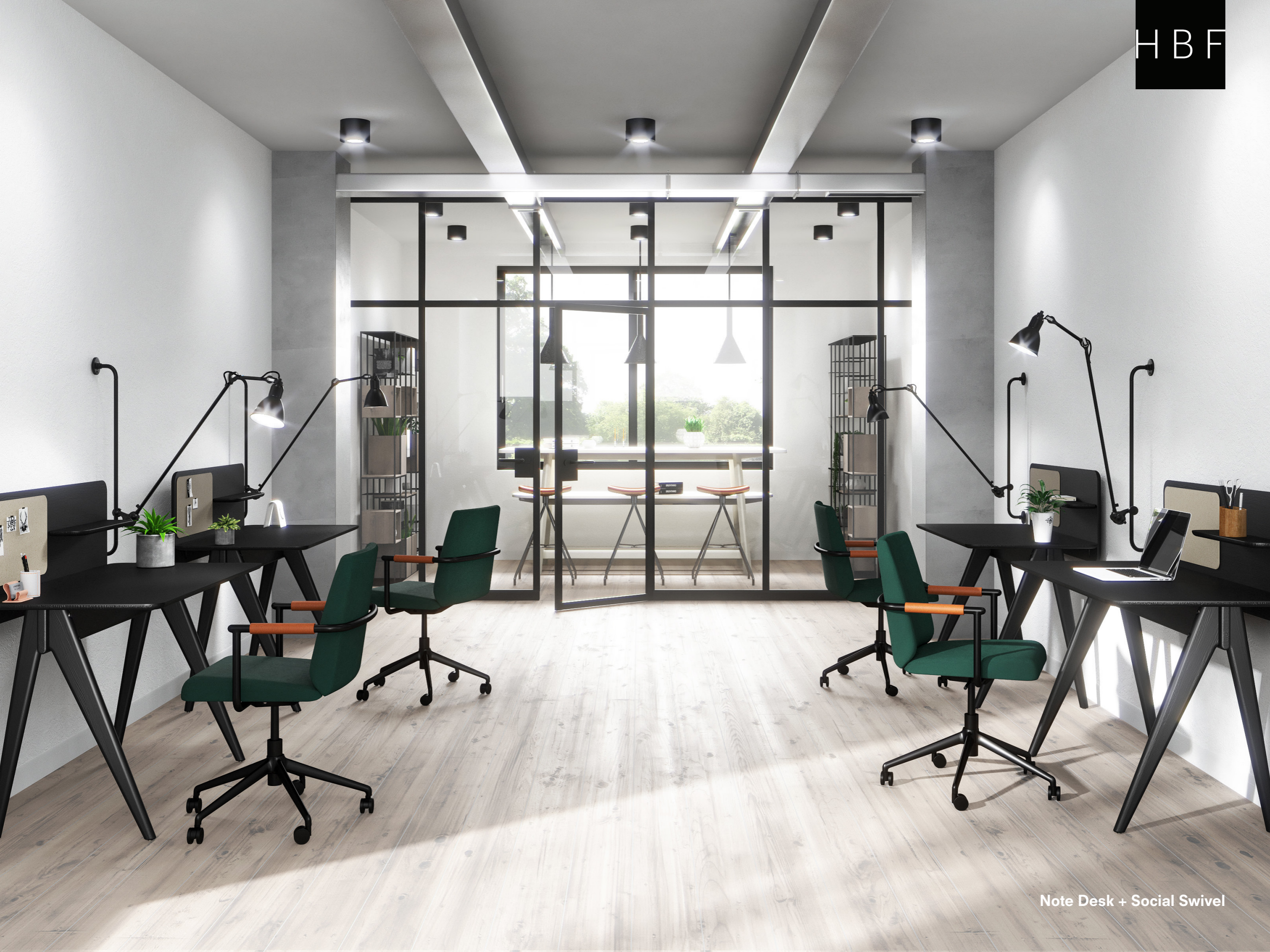
Note Desk + Social Swivel