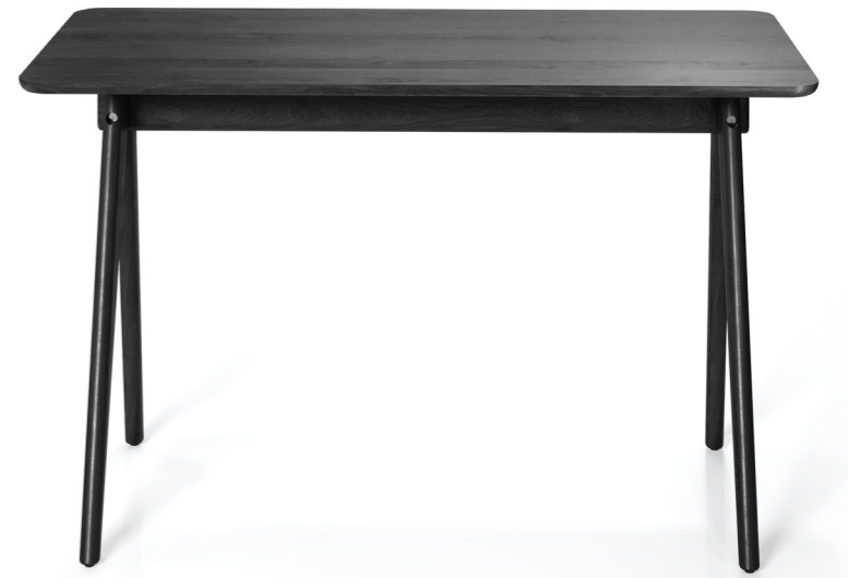
RK402 – Black Opaque