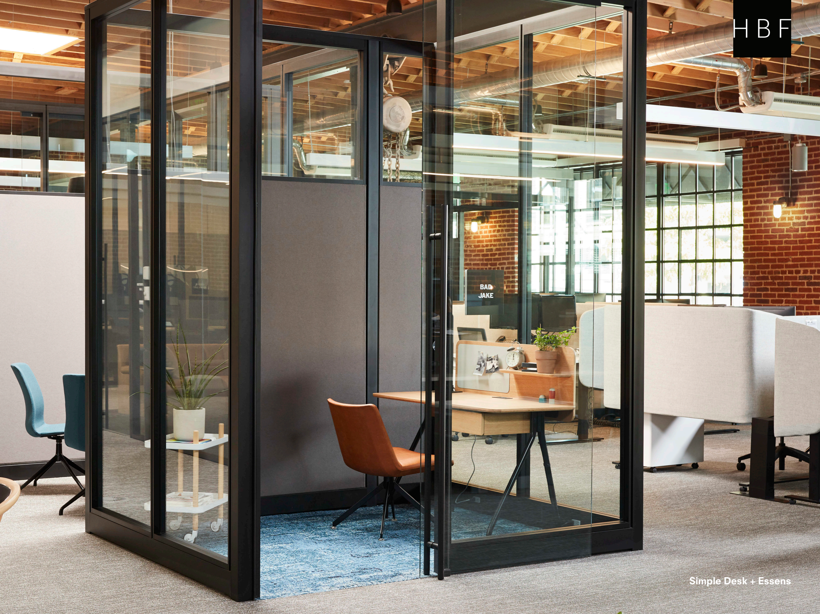
Simple Desk + Essens