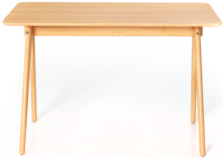
RK400 – Clear Oak