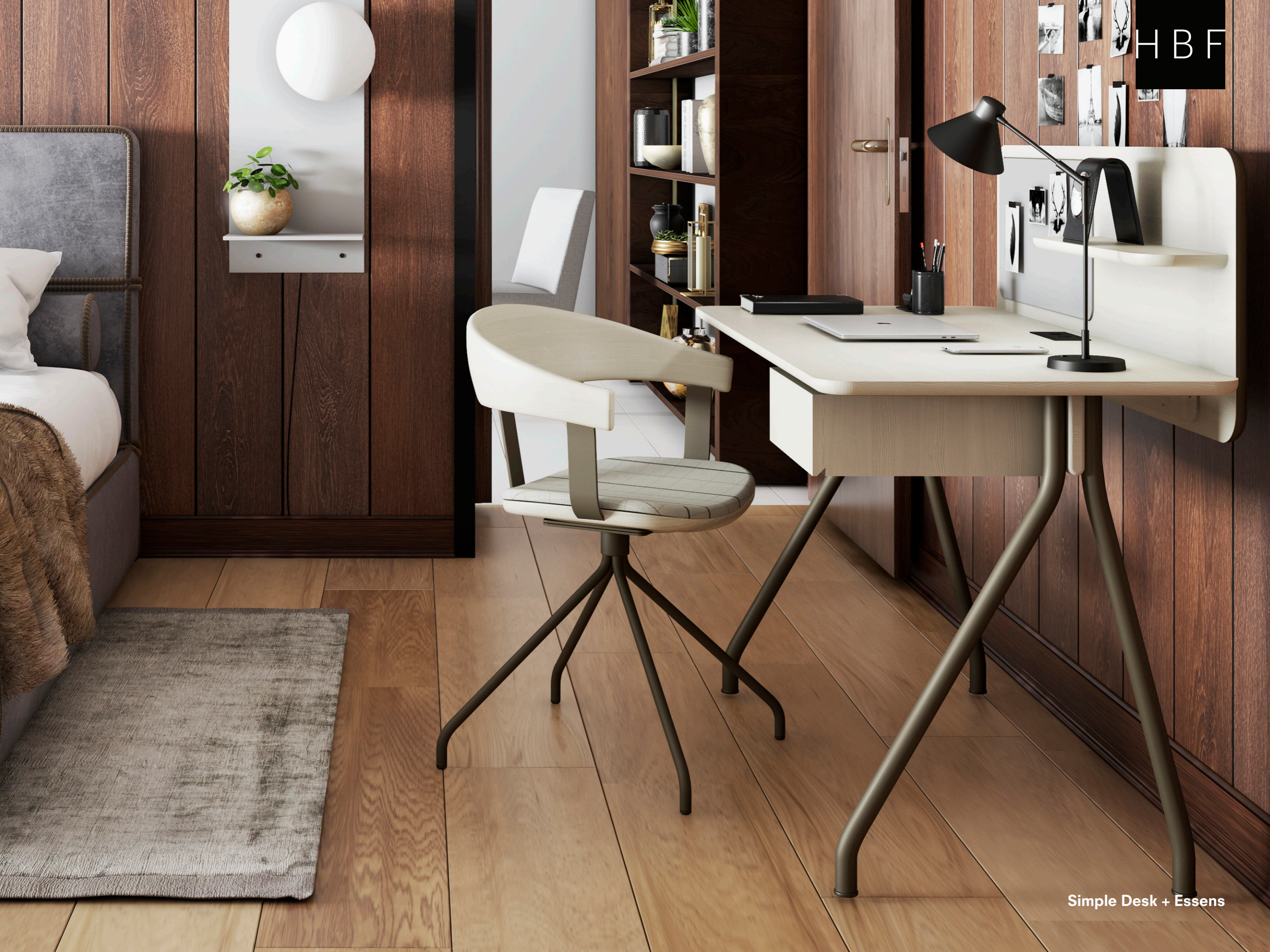
Simple Desk + Essens