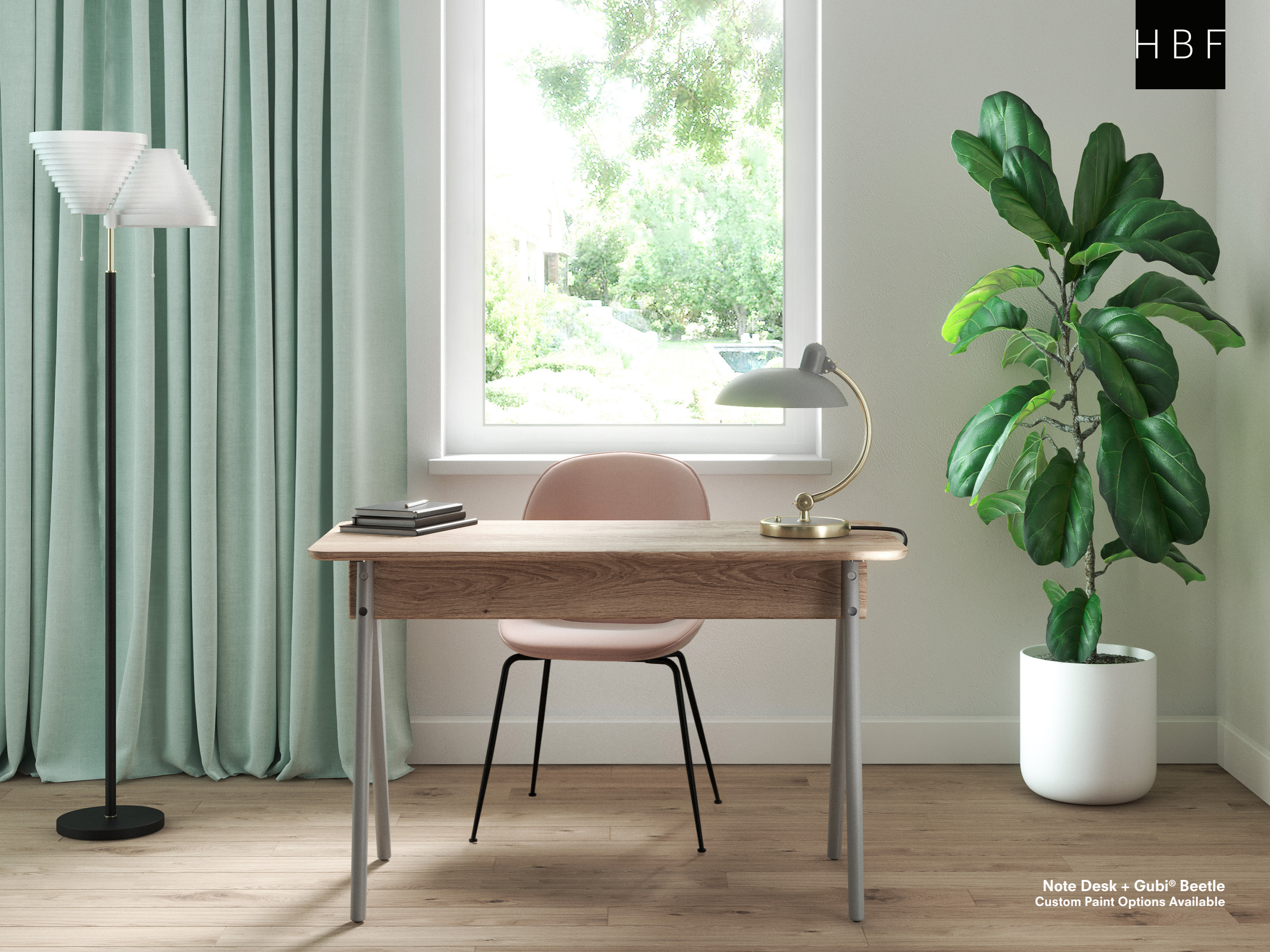
Note Desk + Gubi® Beetle Custom Paint Options Available