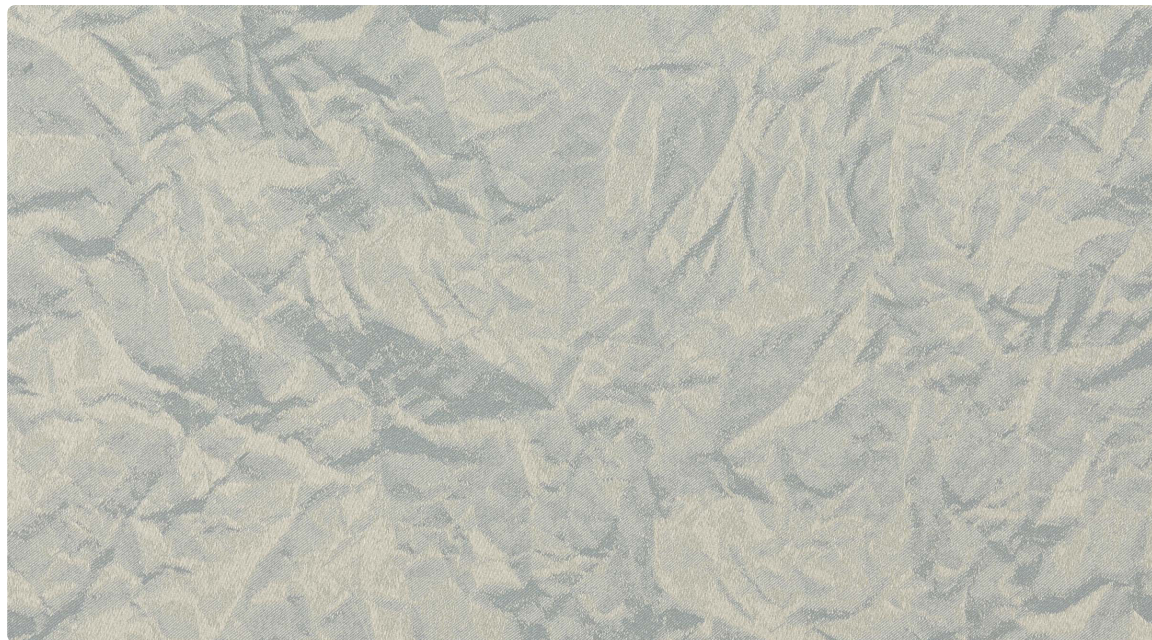
1060-54 Rice Paper