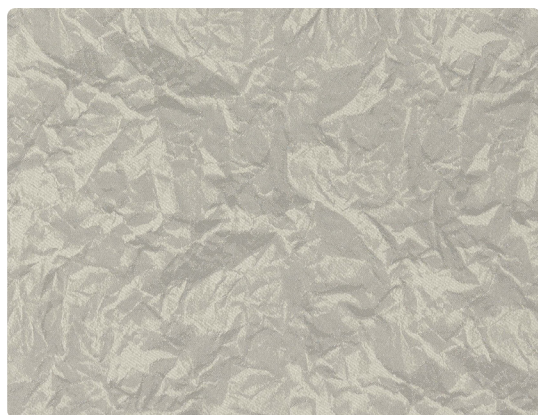
1060-37 Kraft Paper