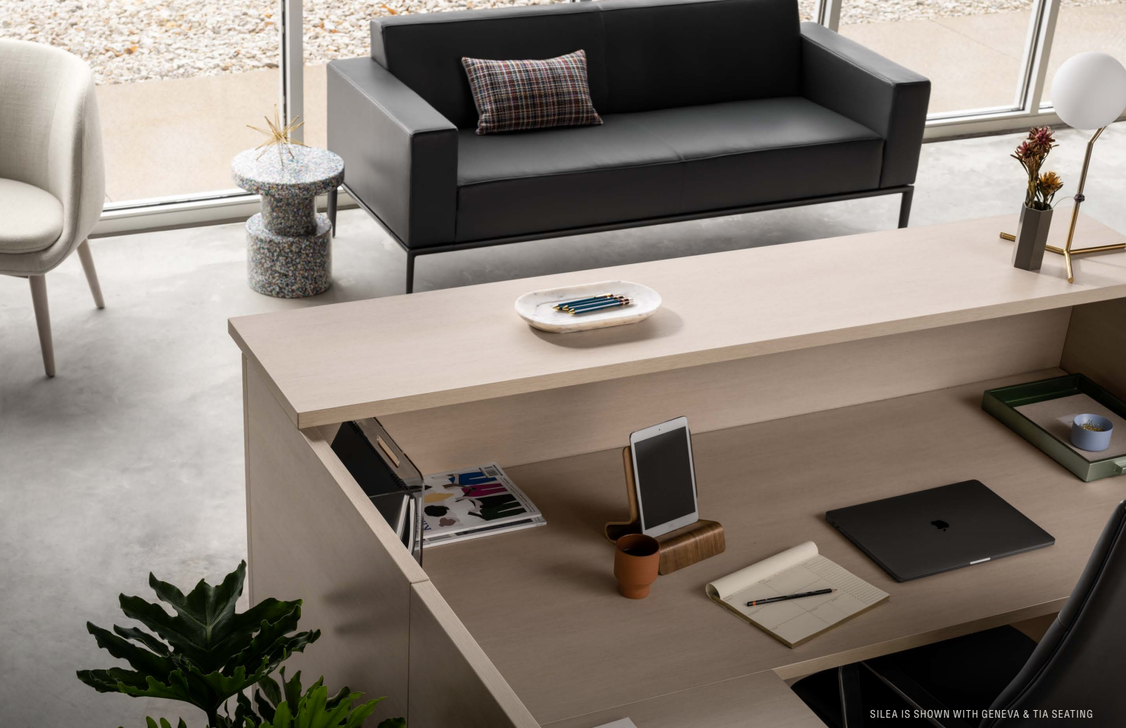
SILEA IS SHOWN WITH GENEVA & TIA SEATING