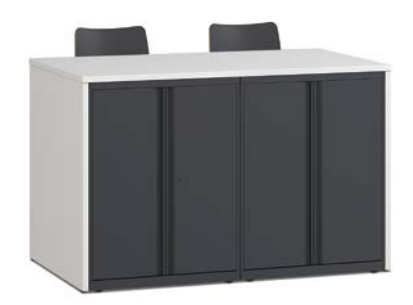
Compatible with Flagship® Storage