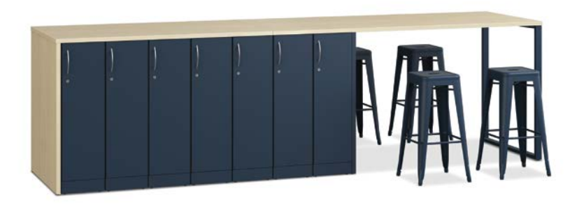
Compatible with Contain® Storage