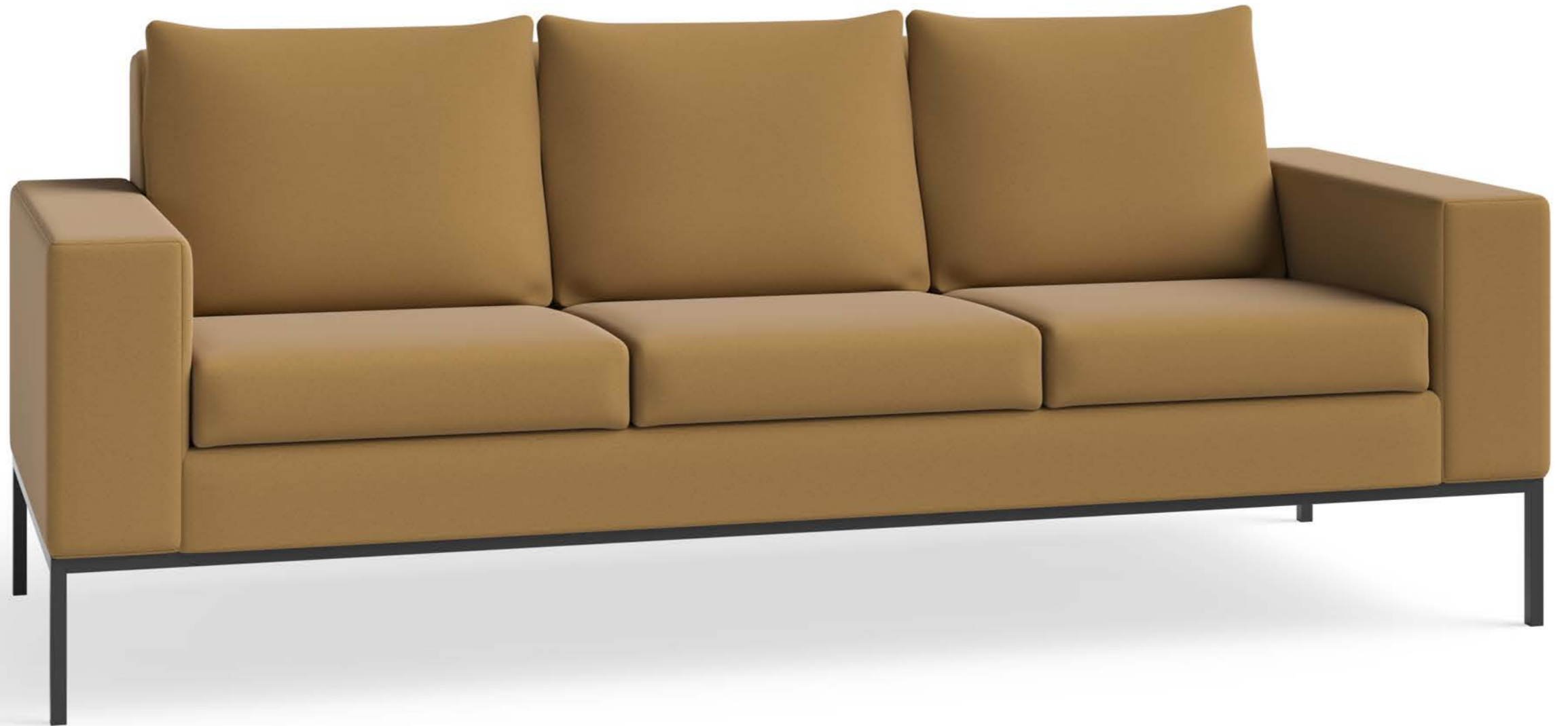
Max Sofa Metal Base