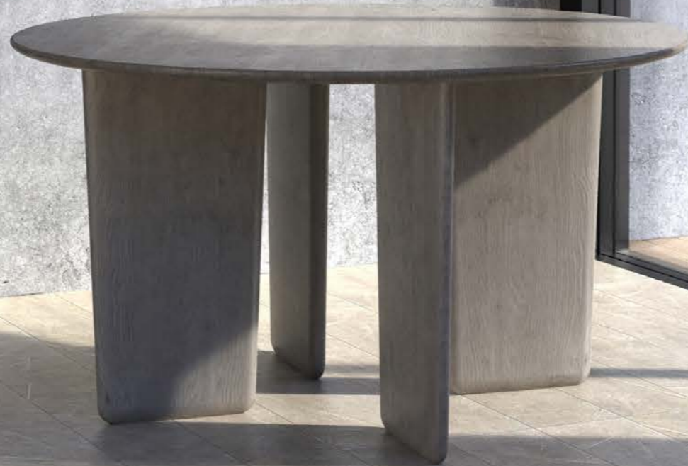
Harmoni Round Conference Table