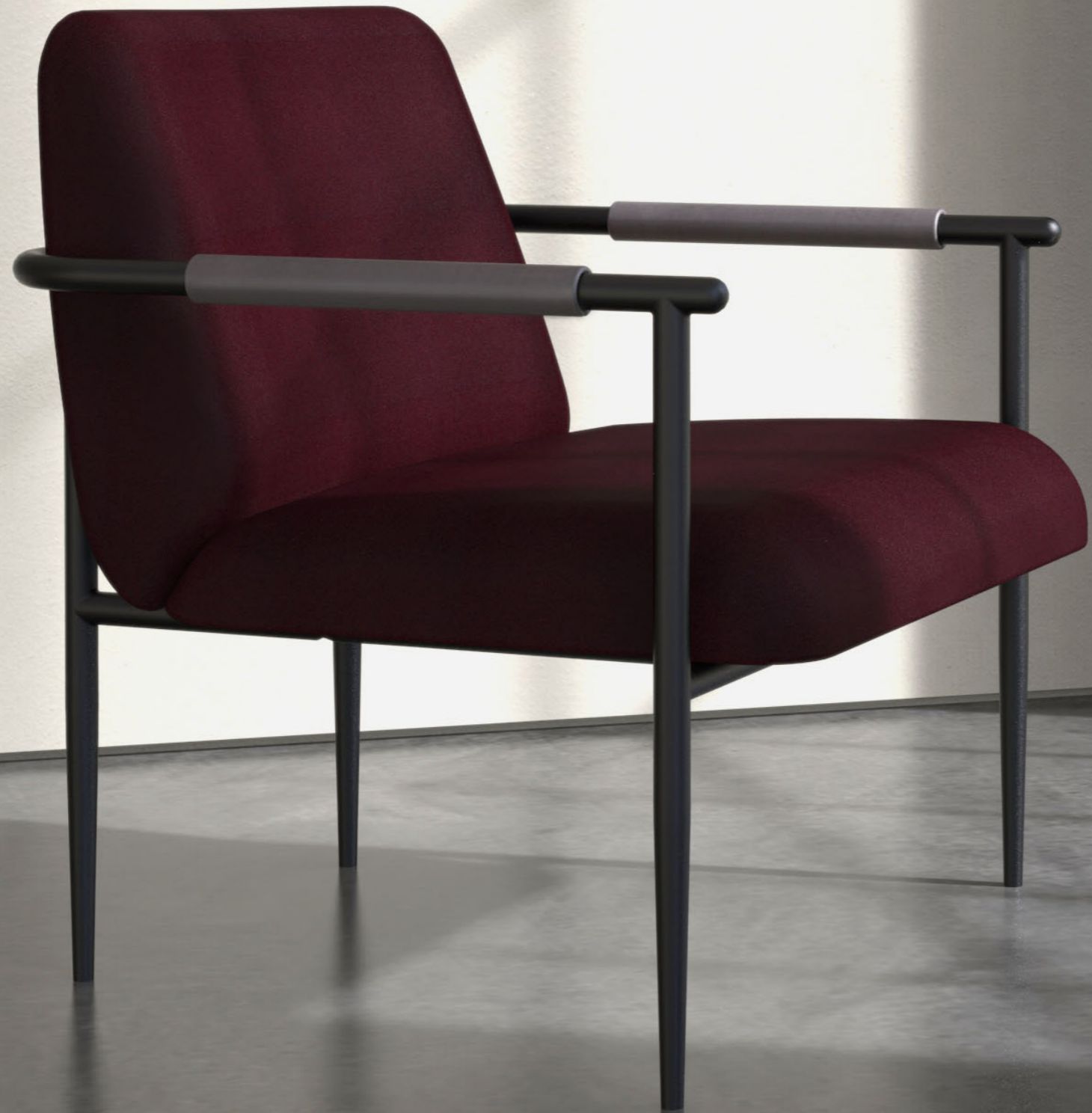
Social Lounge Chair