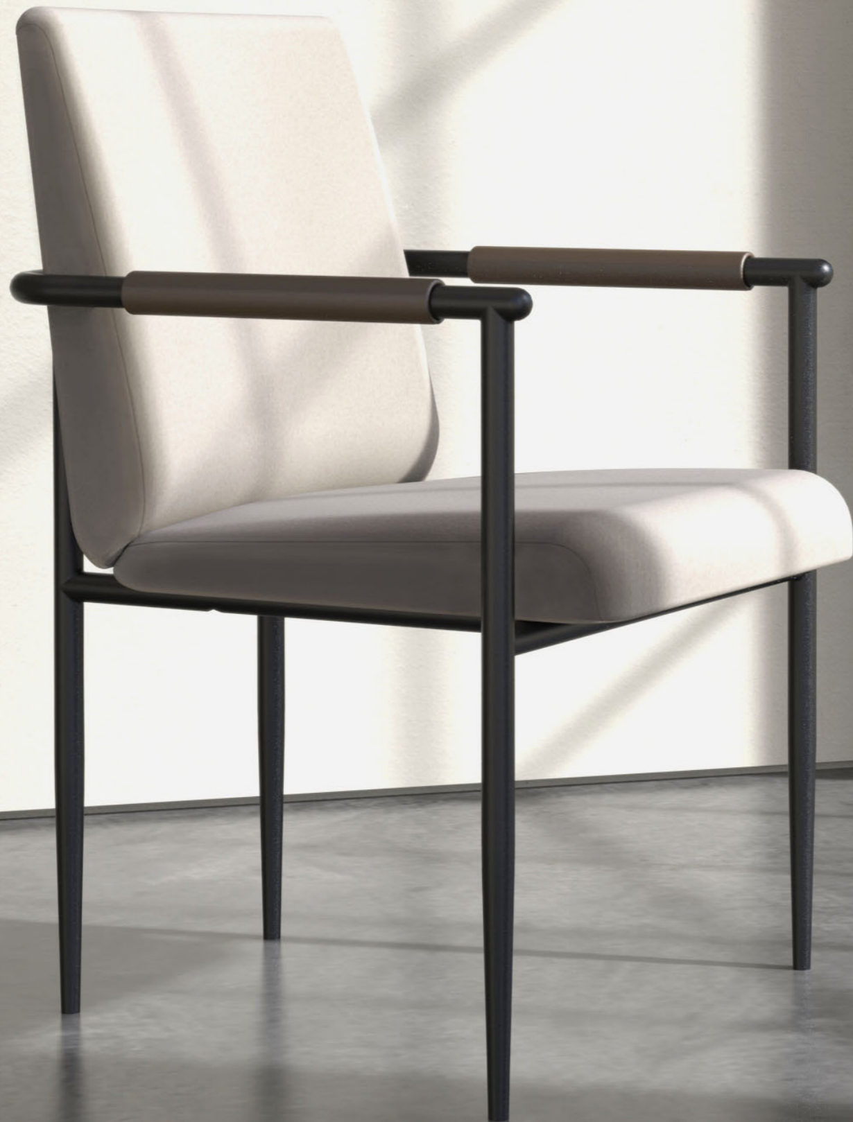
Social Guest Chair