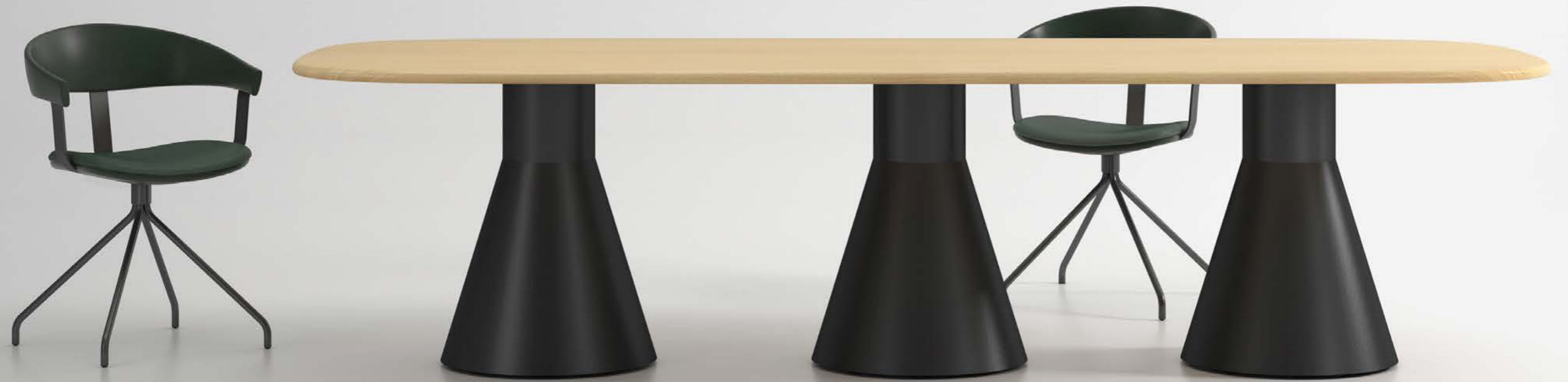
Torre Conference Table