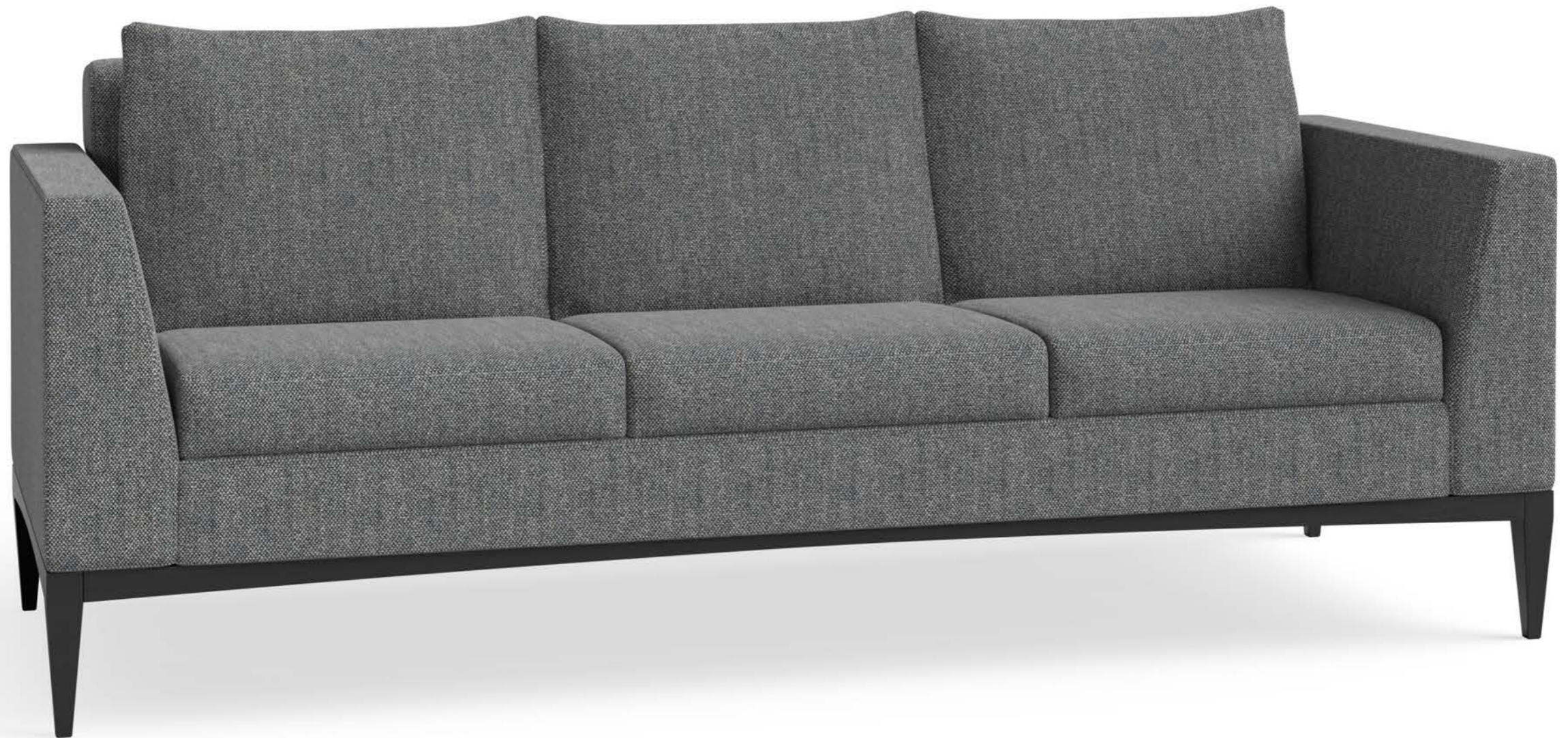
Morgan Sofa Wood Base