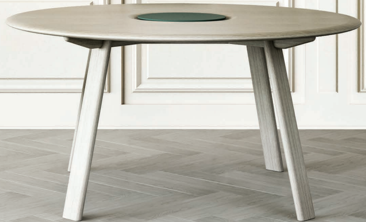
Ami Round Conference Table