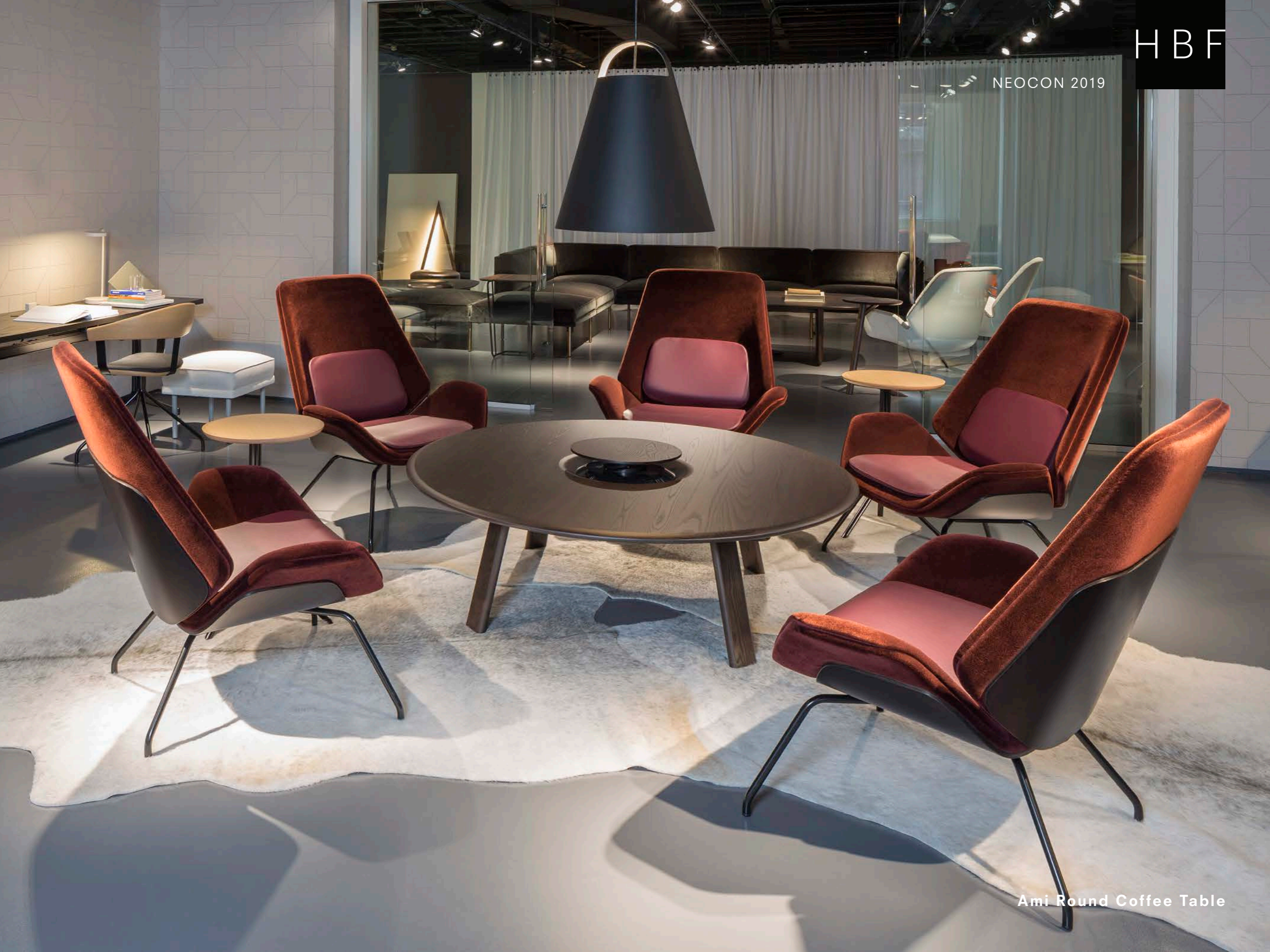
Ami Round Coffee Table