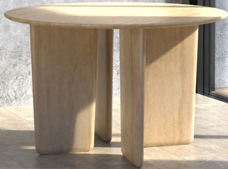
Harmoni Round Conference Table