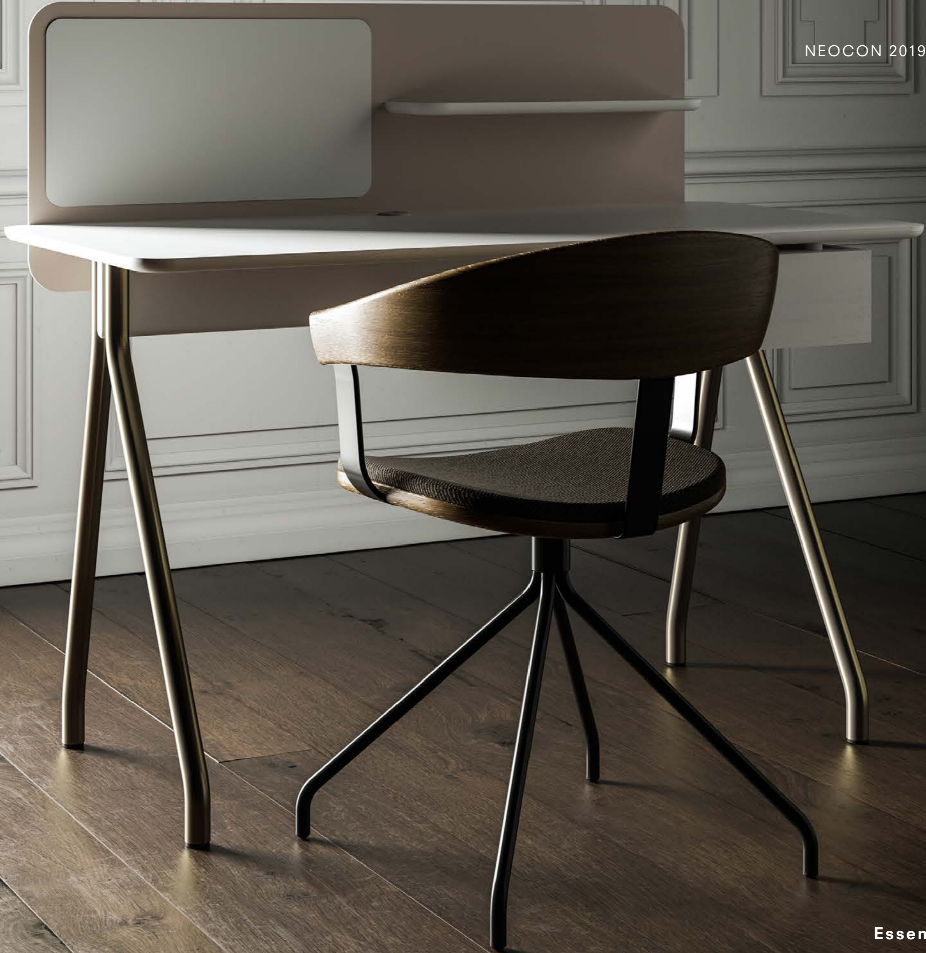
Essens Guest Chair