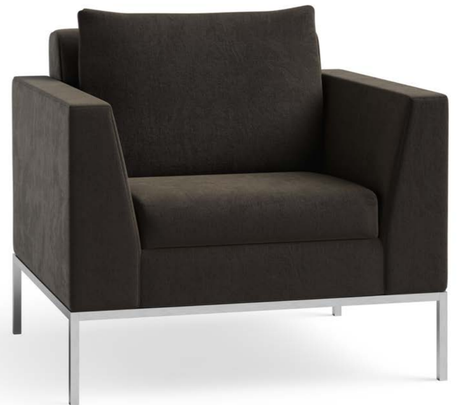
Morgan Settee + Lounge Chair Metal Base