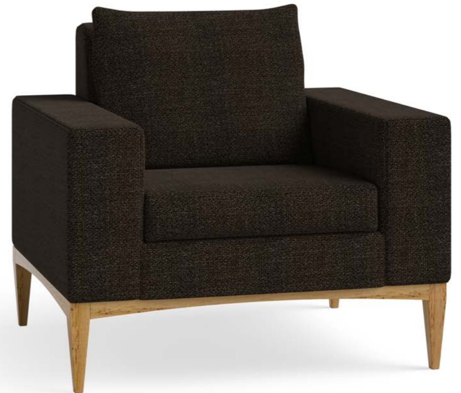
Max Settee + Lounge Chair Wood Base