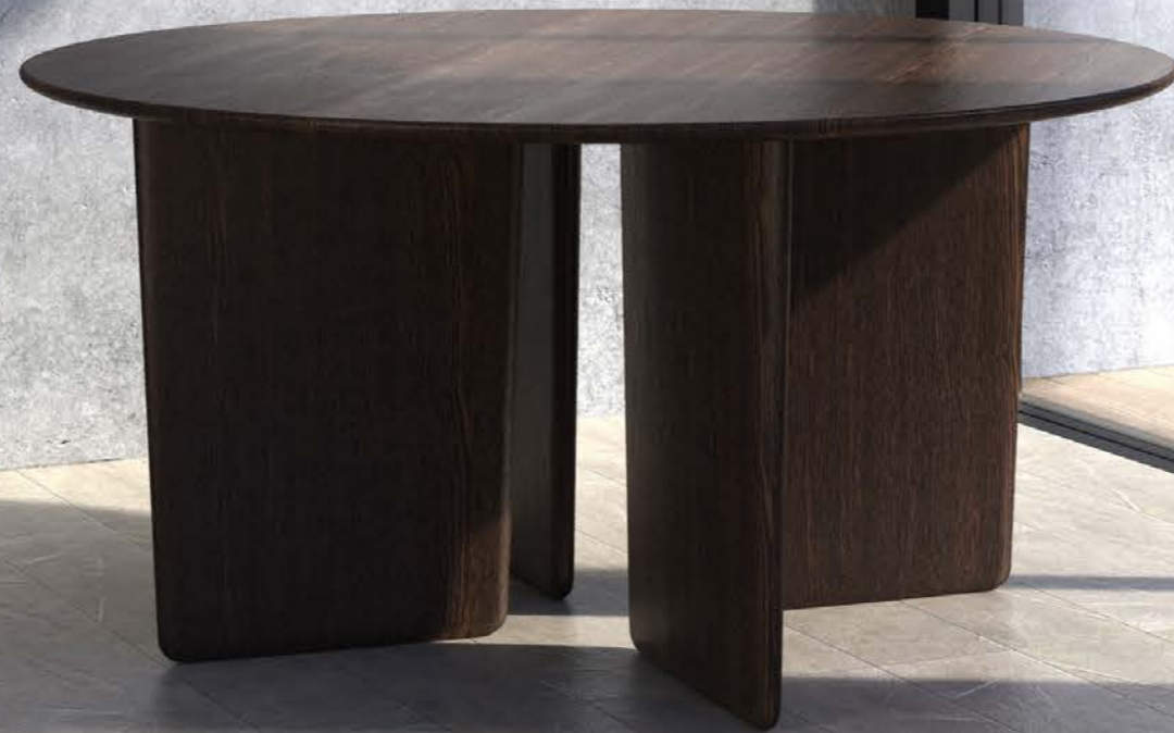
Harmoni Round Conference Table