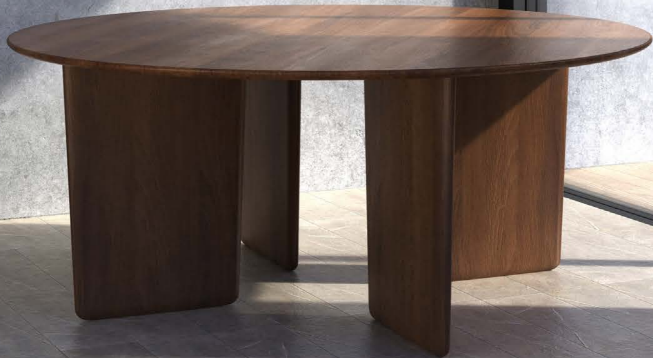
Harmoni Round Conference Table