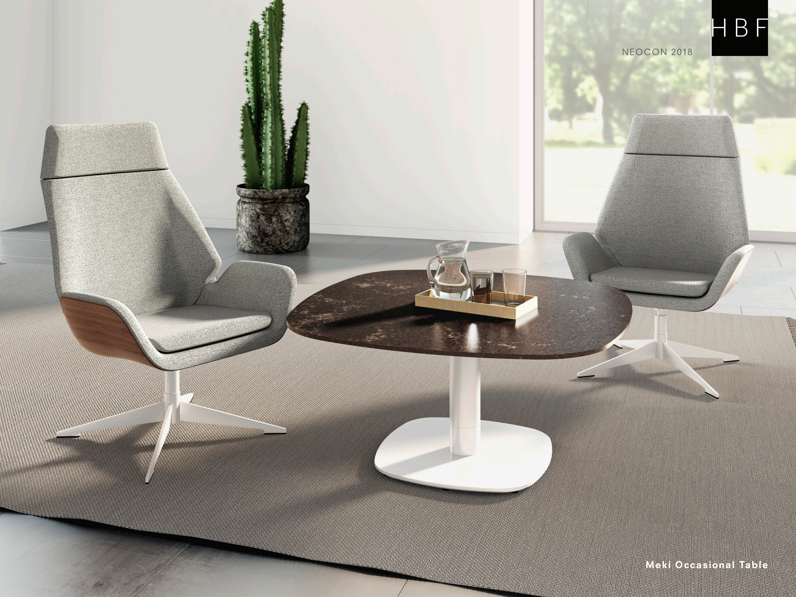
Meki Occasional Table