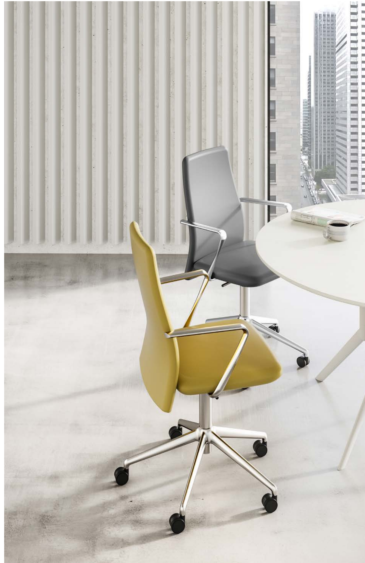
Vela Swivel Tilt