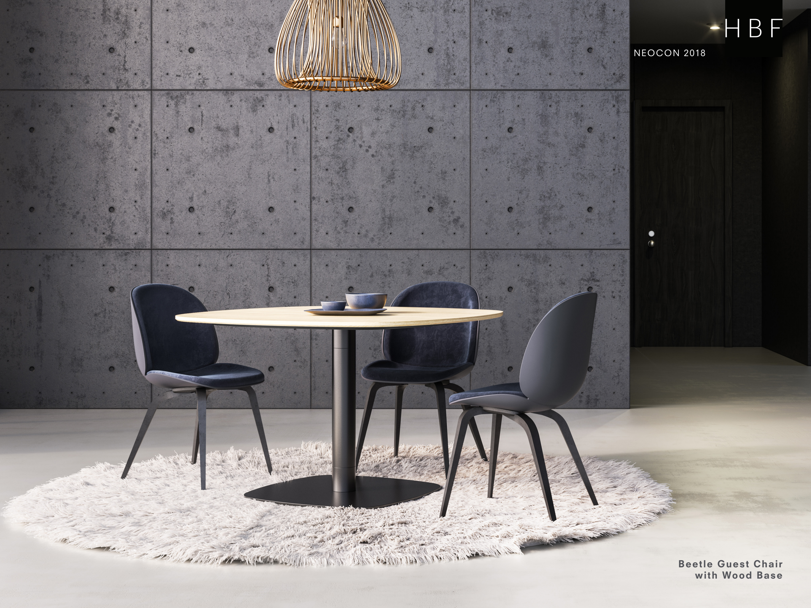
Beetle Guest Chair with Wood Base