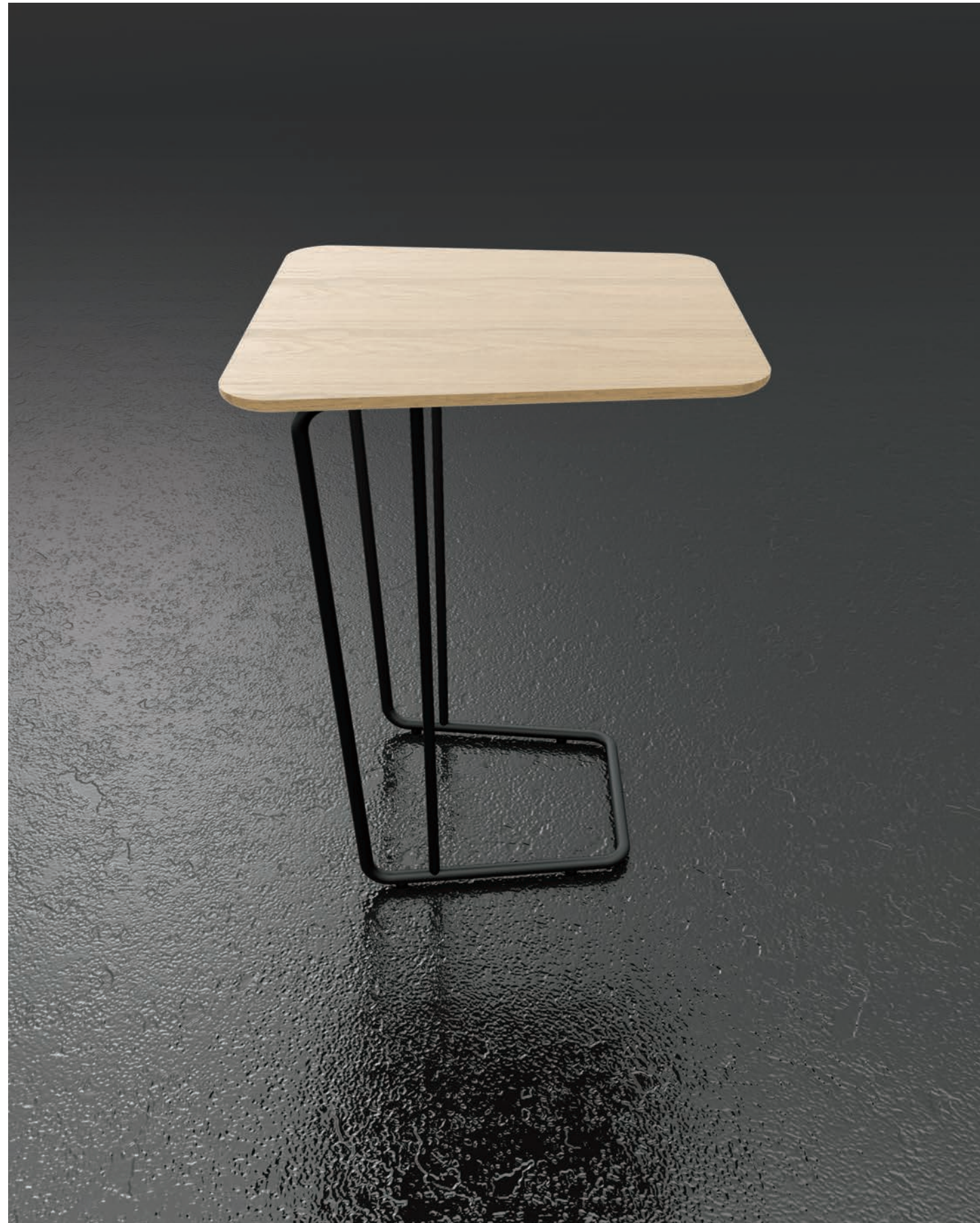
Link Satellite Table