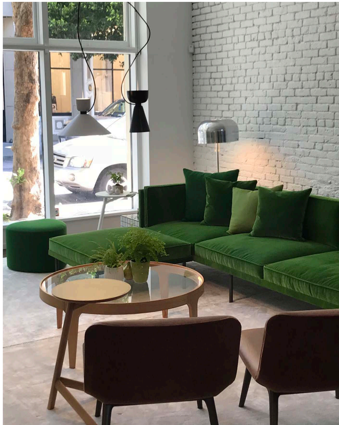
MOD Sofa + Ottoman