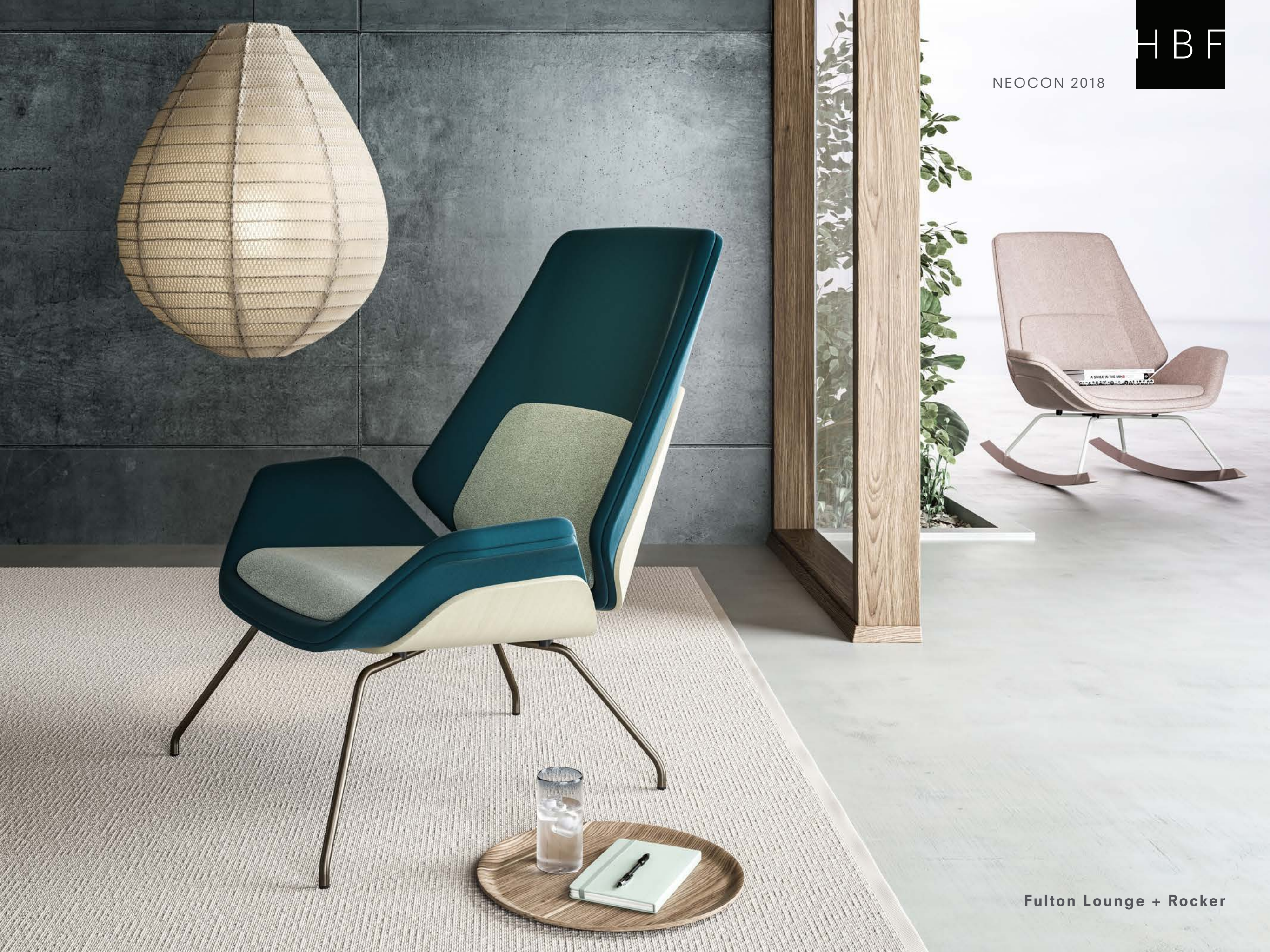
Fulton Lounge + Rocker