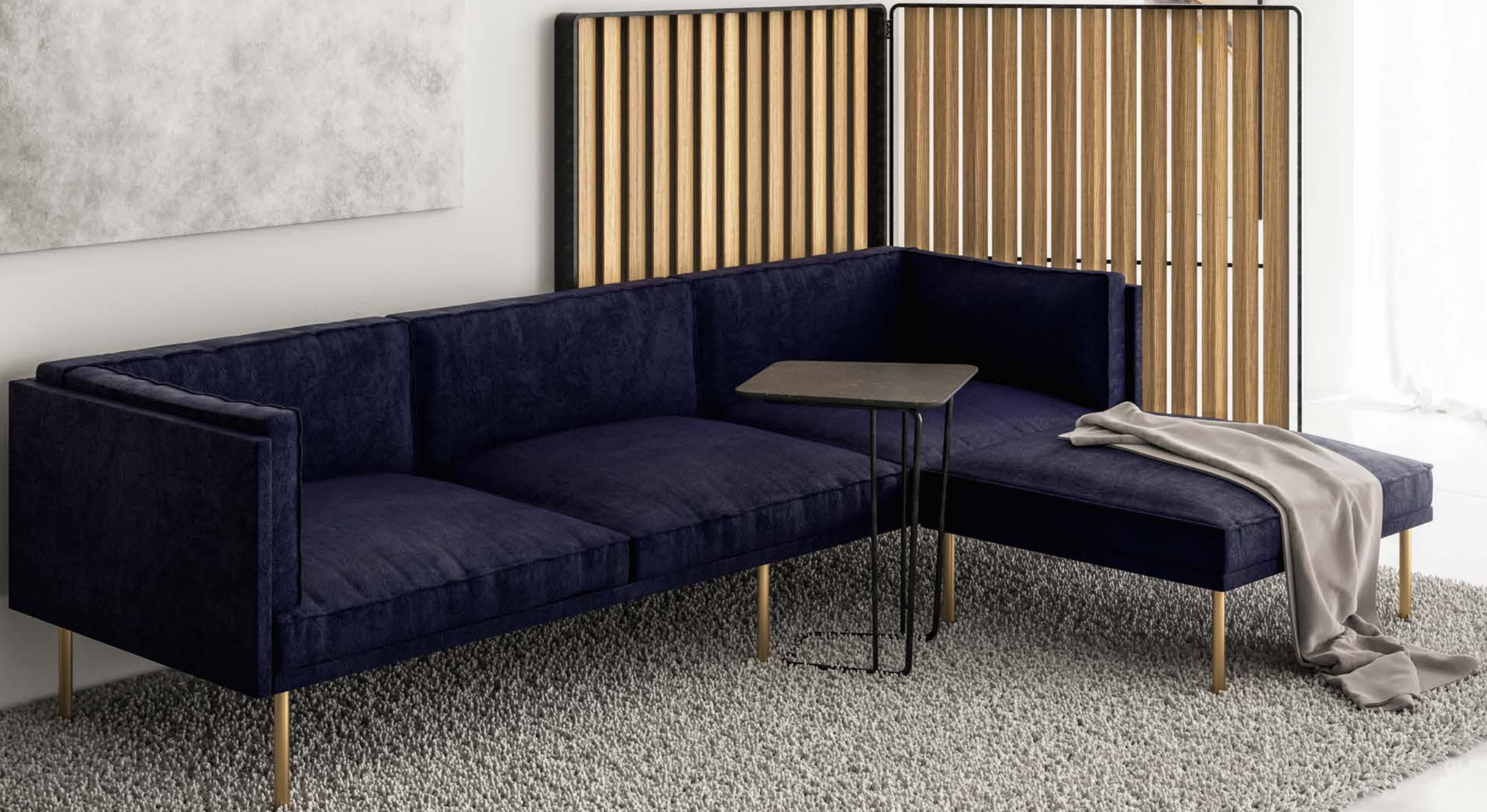
MOD Sofa + Ottoman