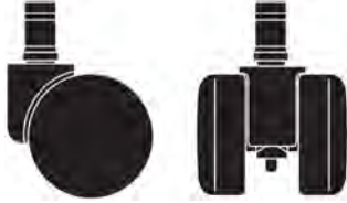
(A) Double Wheel Wheel Diameter 2"