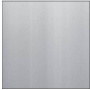
PAL Polished Aluminum

Screen images are intended as a guide only and should not be regarded as absolutely correct. For exact color/texture, please visit www.hbf.com to request an actual sample.