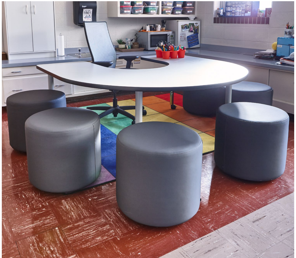
Featured Products: Build tables, Flock minis, and Ignition seating

After thorough consideration, it was determined that the outdated furniture needed to be replaced with kinesthetic, sustainable solutions, arranged in comprehensive, multipurpose layouts to support students and teachers alike. HON's Build and SmartLink—two customizable, durable, and reconfigurable series of tables, desks, and seating—were incorporated to encourage creative, hands-on learning and an inclusive, connected environment for students of all backgrounds and learning abilities.