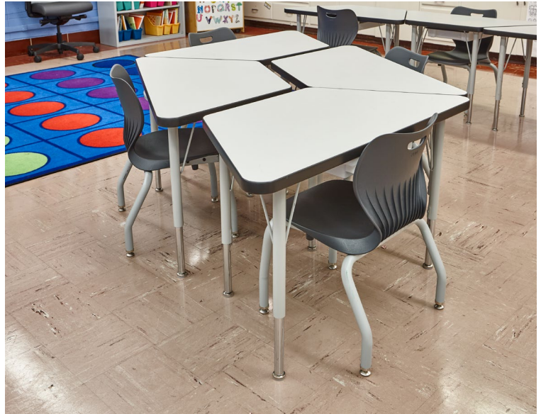
Featured Products: Build desks and SmartLink seating

The goal—to provide unique flexibility to support changing needs—exceeded expectations. Students are taking more pride in their surroundings and connect with one another more readily, while teachers navigate more efficiently and effectively. There is no longer a hodge-podge of various styles of desks and chairs; the district can flex furniture throughout different classrooms/schools based on enrollment needs while maintaining a consistent and appealing look and feel. With the elementary and junior high schools completed, Rock Island-Milan School District #41 is living its mission of preparing students for individual success, by providing a safe and inclusive education in a multicultural community.