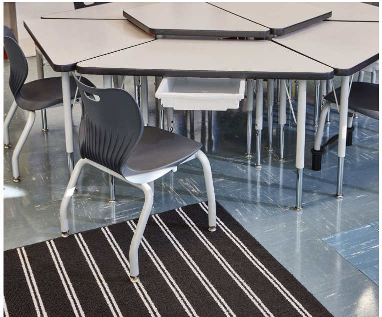
Featured Products: Build desks, SmartLink seating and accessories