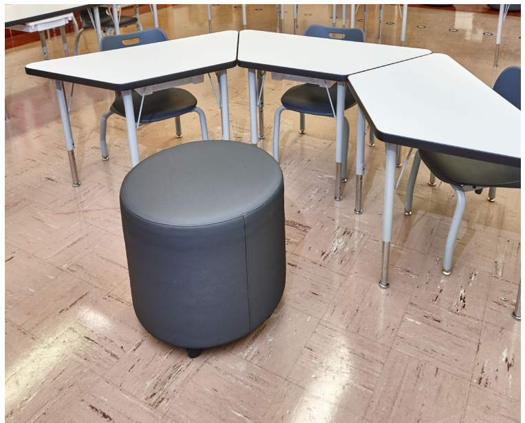
Featured Products: Build desks, SmartLink seating, and Flock minis

“Going into this, I assumed I would have to do the heavy lifting but the level of service we received from HON & HiTouch exceeded my expectations. Overall, it was a smooth sailing process, and the team brought my vision to life.”