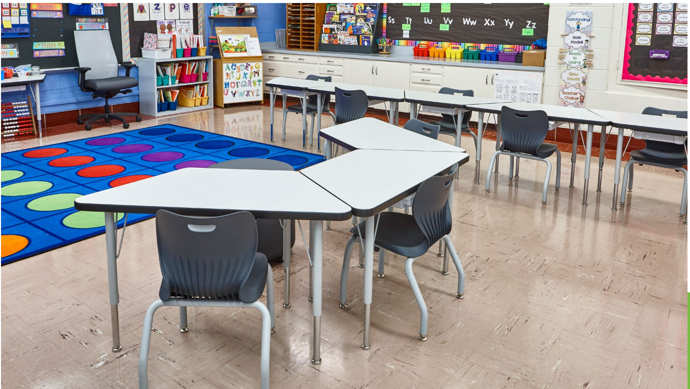
Featured Products: Build desks and SmartLink seating