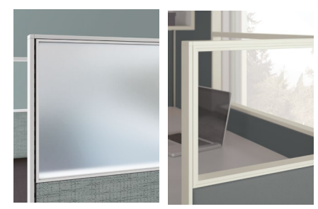
GLASS PANELS Frosted and clear glass stackable glass panels support limitless layout possibilities - up to 80".