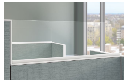
FRAMELESS GLASS Let in the light with crystal clear or frosted glass options.

GALLERY PANEL Customize a cohesive look with classic woodgrain or solid laminate gallery panels.