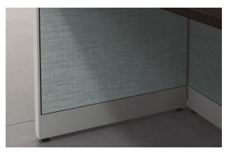
TECHNOLOGY Power up with a metal base rail that supports easy access to data and cancels out cord confusion.