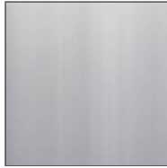
PAL Polished Aluminum

Screen images are intended as a guide only and should not be regarded as absolutely correct. For exact color/texture, please visit www.hbf.com to request an actual sample.