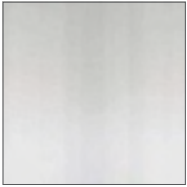
POL Polished Chrome