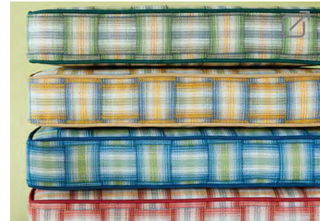
Lawn Chair 1077