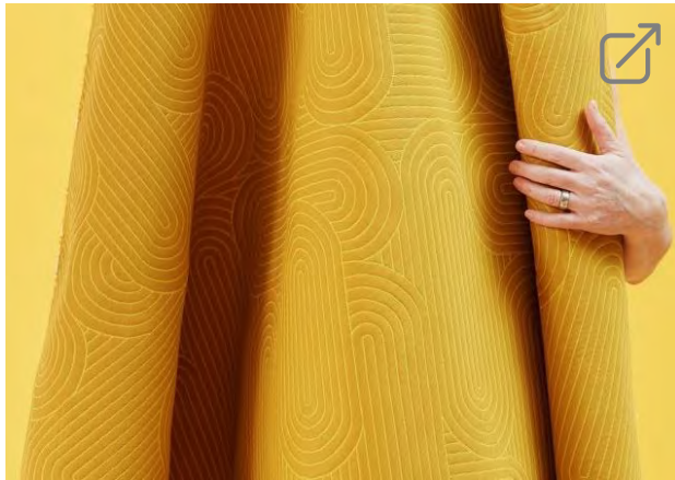
Ms. Quilty 2.0 1078