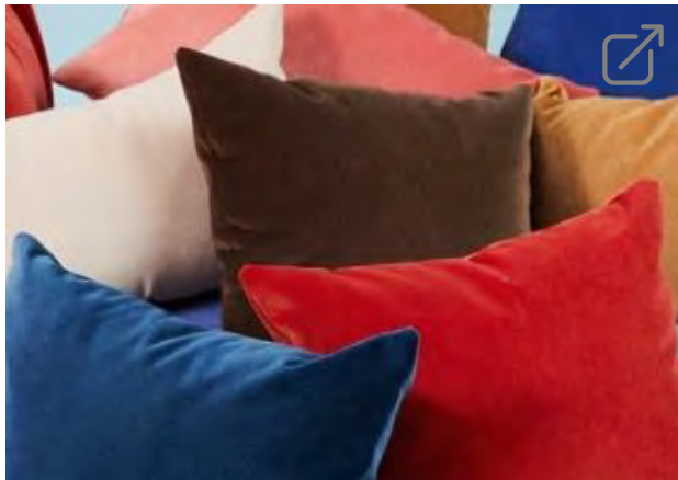
Comfort Zone 905