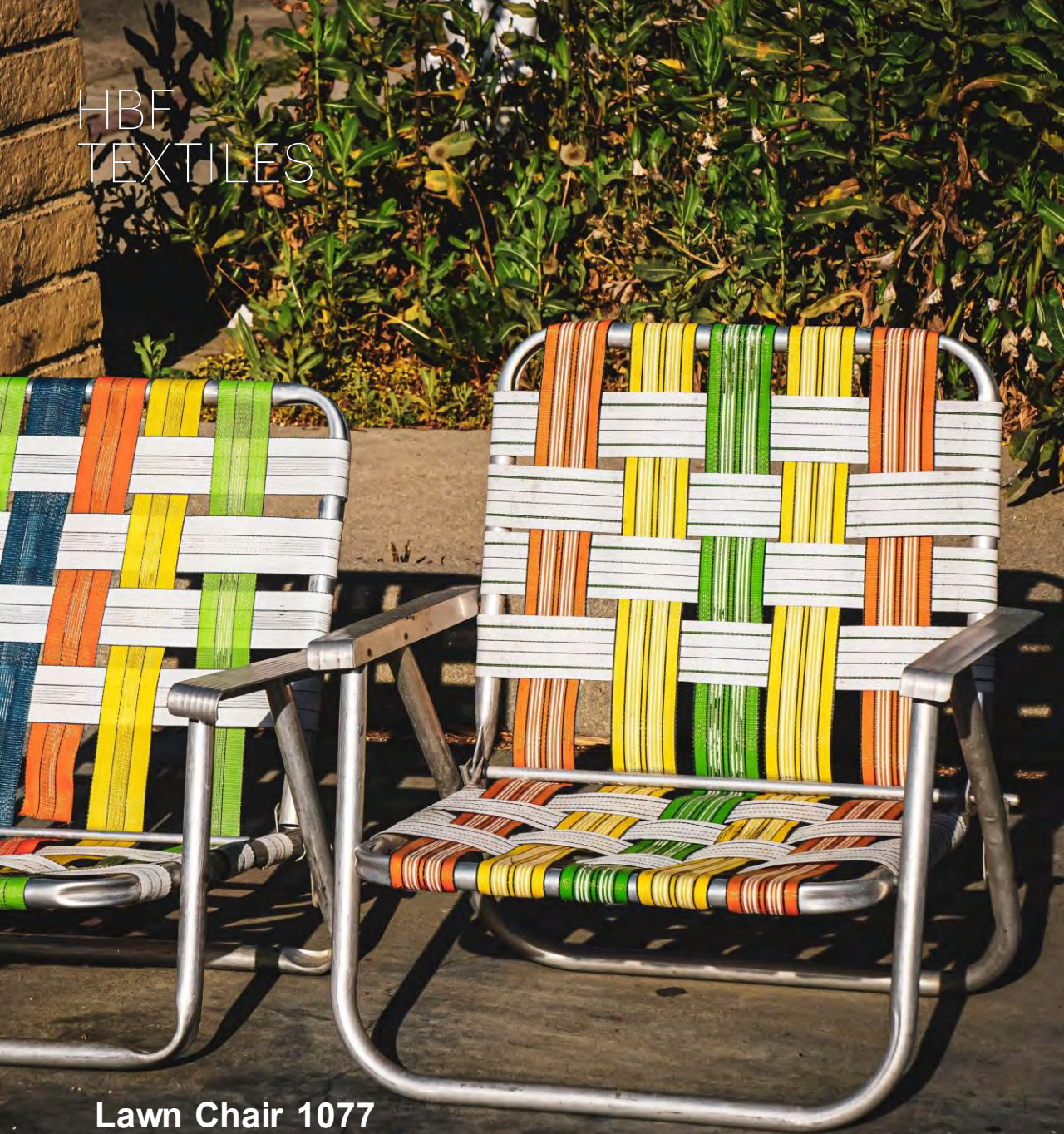
Lawn Chair 1077