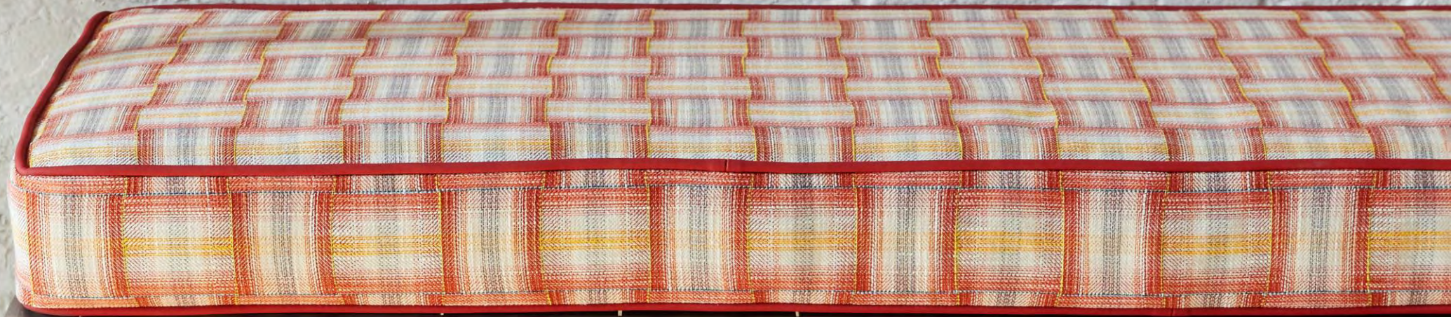
Lawn Chair 1077