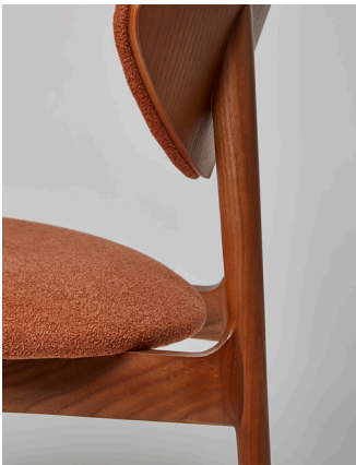
Karina Armless shown in Nutmeg Ash Frame