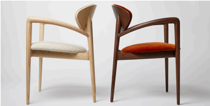
Karina with Arms shown in Clear Ash and Sumatra Ash Frames