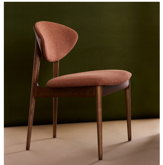
Karina Armless shown in Nutmeg Ash Frame